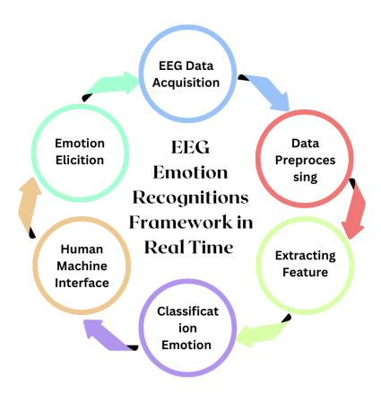
Fig. 1: Data Capturing system.

unvoiced/speech ratio had been additionally estimated. By using sequential backward capabilities choice technique, a 11-dimensional characteristic vector for every utterance changed into used as enter withinside the audio emotion reputation system.