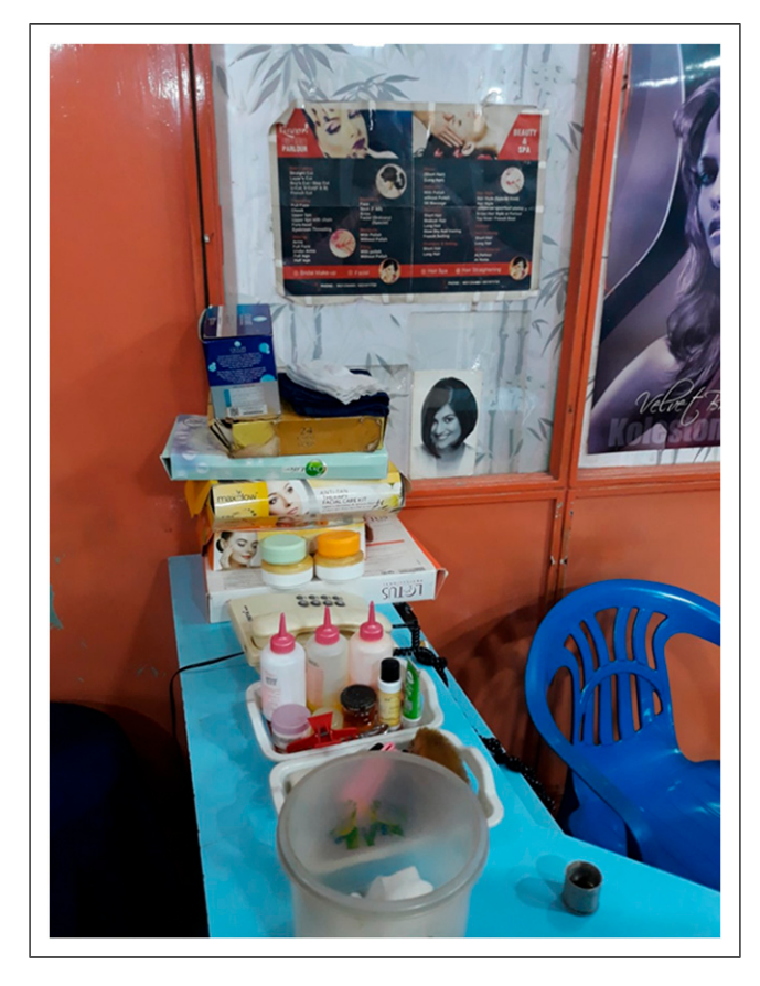
Figure 4. Reception desk in a neighbourhood parlour, Kolkata.

Our chats clearly pointed towards the limitations of education and training opportunities as means to challenge patriarchal gender relations in the family and the community. The most contested issue that the teachers at the Centre were aware of but could not address was that filial obligation and gender norms informed the division of labour in the home. While home here emerges as a site of conflict, between women and men, and between generations of women, collective imaginaries that linked make-up and grooming with social acceptance and consumer culture made beautician training away from home acceptable, accessible, and even desirable. However, those who needed an income most, young mothers like Preeti, whose household relied on her husband's odd jobs as an electrician, were least equipped to enter the profession. As Doris pointed out, those in the group already married, pregnant or mothers were not only tied to the home by heavy workloads and the expectation they would act as 'housewives', their domestic commitments made them less likely to get a placement, because potential employers preferred young women without obligations who could work on-demand and at short notice.