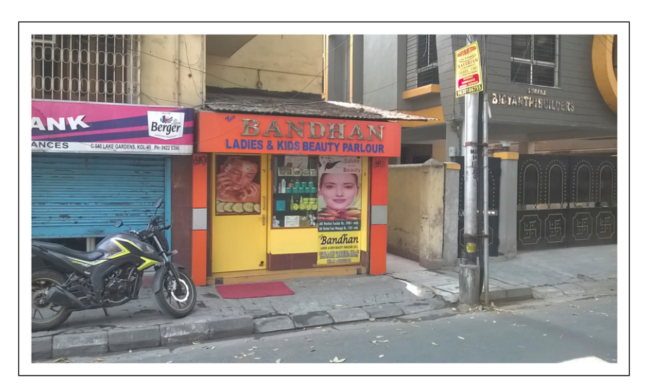
Figure 2. Neighbourhood parlour in south Kolkata.

Concerns about the ambiguous status of beauticians were shared by Doris, who also arranged placements in neighbourhood salons (see Figure 2). While most arrangements were only short term, she was actively selecting unisex women-only parlours and did not include male grooming practices in her training. By not teaching her wards those basic techniques, and by arranging placements herself, she attempted to reframe the moral