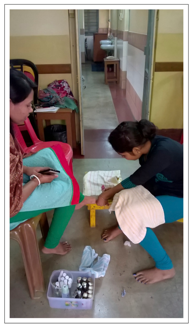
Figure 5. Training session at the Centre.

they said lacked 'dignity', and emphasized that their tangential association with the beauty sector through the course provided a glimpse of a materially rich fabric of life, of skills and self-worth that would benefit the family and community they stem from. This link was present in conversations that framed the practical part of the training during which the group discussed and exchanged images, for example, of specific nail craft designs and henna patterns found on the internet, which they shared as text messages. For brief moments, these