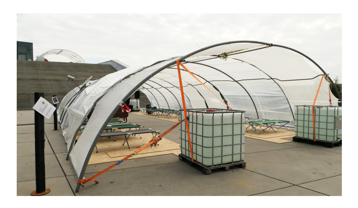
SLEEP 48 at STWST48x4 14:00 Sept 7th – 14:00 Sept 9th, 2018, Linz, Austria.