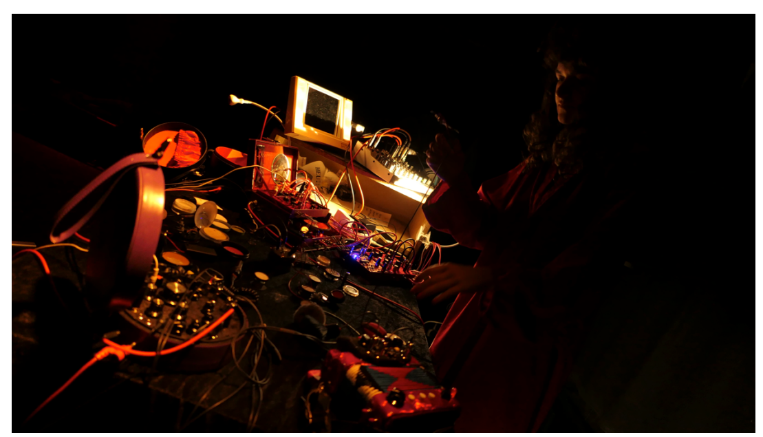
Ioana Vreme Moser

at 6:31am, we walk out of club, into the Danube... a boat ride down the Danube for early breakfast and a bit stretching.