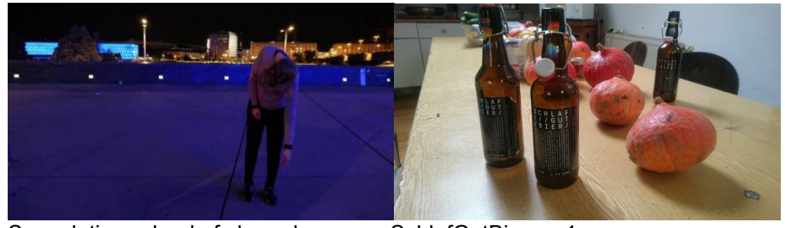
Speculative school of sleep dance