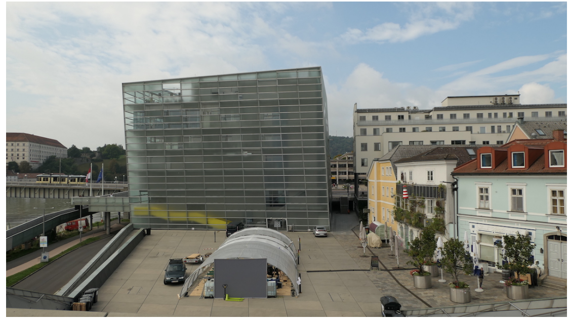
SLEEP TUNNEL at Maindeck, Stadtwerkstatt