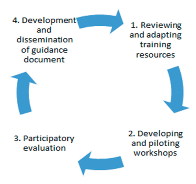
Figure 1. Representation of the project's action research cycle.

From July 2018 separate workshops for men and women were held at the NGO centre, facilitated by the external trainers and NGO staff. The workshops followed a similar structure to previous years, but with a curriculum and approach informed by the preworkshop sessions and ongoing evaluation and learning events. An aim of this participatory evaluation process was to develop a critical lens on these workshops, based on insights from participant observation conducted by two university researchers. These researchers also facilitated focus group discussions and interviews with the workshop participants, facilitators and NGO staff, using participatory and visual methods to facilitate evaluation. Reflections on workshop content, facilitation and participant engagement did not come at the end of the action cycle, but were part of an iterative process, with learning emerging from earlier workshops informing later ones, and further informed by discussion during regular team meetings held at the university or in the city. Using participant observation as a tool within a wider PAR approach, we acknowledge that the meaning of 'participation' differs and blurs, with participant observation generally intended to observe change and participatory research to create change (Wright and Nelson, 1995).