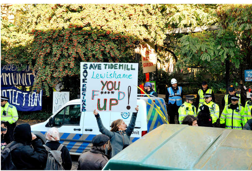
FIGURE 3. Protesting the eviction of Tidemill Garden with banners and poetry. The campaign group had collectively prepared for this day, including banners and artistic interventions intended to demonstrate the emotional and material impact of losing this space. They requested that I document everything to have images for subsequent resistance online.

is experienced as particularly hurtful, with estate regeneration (the demolition of municipal estates to make way for largely private developments) perceived as a deliberate effort to 'cleanse' poorer areas of 'undesirable' people (e.g. Elmer and Dening 2016; Lees and White 2020; Slater 2006; 2017; Watt 2021). Although estate regeneration is justified as housing people on the council waiting list, if this 'necessitates' the displacement of other not well-off people while building predominantly private homes, it raises questions about who regeneration is for. While the lives of some poorer people, particularly those currently in temporary,