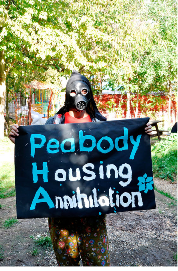
FIGURE 1. A protest using musical improvisation and self-made banners to express opposition to the destruction of Tidemill Garden and structurally sound council housing, and to the displacement of people from homes and community spaces. The gas masks were an important aspect of protests as Tidemill Garden was found to mitigate air pollution by half (Smith 2017) in an area which has dangerous pollution levels. It also had the first death registered to be caused by air pollution (Laville 2020).