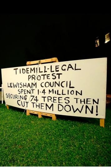
FIGURE 5. 74 white crosses – installation on a protest camp next to Tidemill Garden to commemorate the 74 trees destroyed on the day the local council announced a climate emergency. Lewisham Council claimed it did not have the £50,000 required to redraw the plans according to a design drawn up by an activist architect which would have built the same number of housing units while keeping the garden and a council block. Instead, the council spent £1,400,000 on securing the garden before its destruction. The loss of the garden, a socially-autonomous space for artists, families and 'marginal characters', triggered root shock in many, expressed through this installation mirroring a war cemetery. Photos: Anita Strasser, 2018.

their homes. They often placed themselves in favourite corners or chose meaningful activities and items as motifs. Residents wanted to counter the stigmatising representations of council estates and residents and enact their emotional attachment to home and place. The intention was to humanise displacement through visual (and textual) portraits that tell of residents' at-