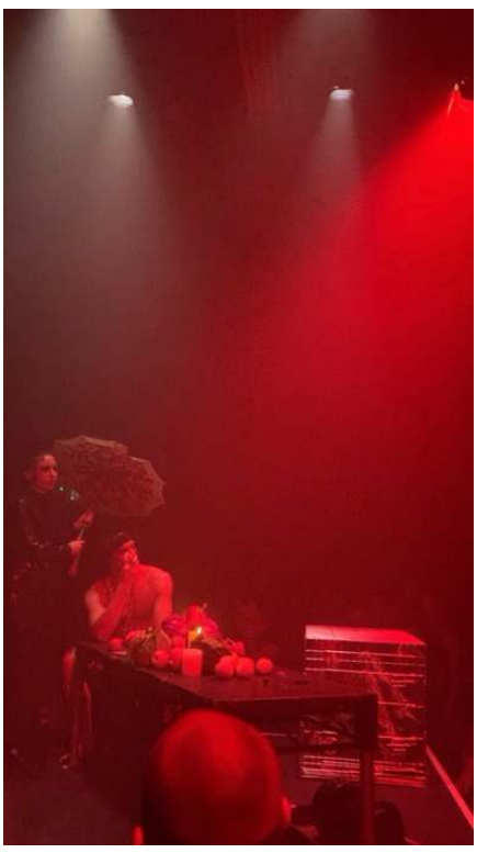
Screenshots from a video taken of the performance. Choreographed by Nick Finegan.

There is stillness again. Until, the other two dancers come forward. They take deep, thick, slow steps. They turn, and pause again, before gliding into honeyed poses. The music drops like the heat of a summer day breaking to rain. The bass and driving triplets cast the two attendant dancers' arms back over their heads in a deep back