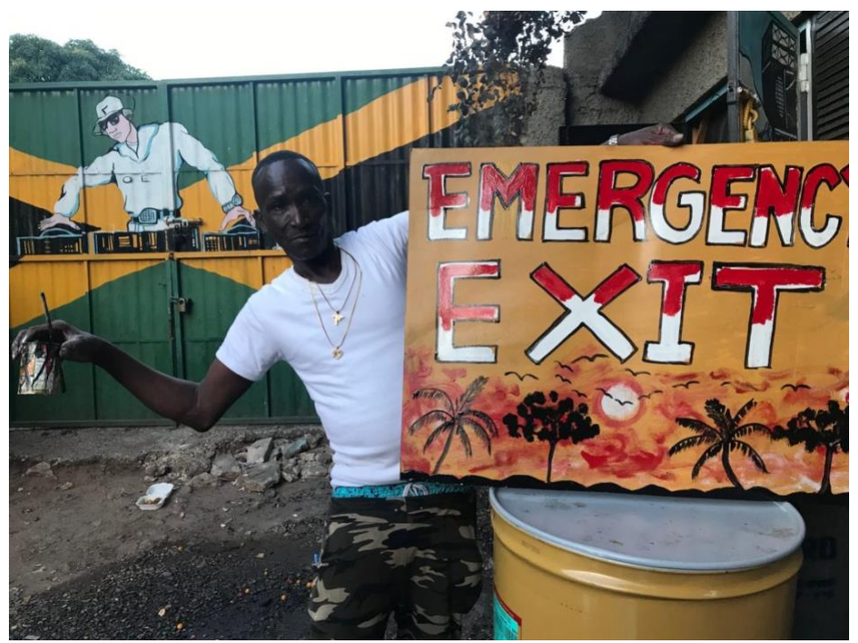
Sounds of the Future event: preparing the venue to meet health and safety standards. JSSF HQ, Kingston, Jamaica, February 20, 2022.

The authorities often blame sound system sessions for causing violence and social unrest rather than seeing them as grassroots strategies to overcome or at least ameliorate existing social challenges (Rivera 2022). The substantial value of sound system culture was certainly one of the points raised in the reasoning discussion. Jamaican sound systems are in fact only an example of one type of street culture and technology. Columbian picós , Mexican sonideros , or Brazilian radiolas and aparelhagens make equally fertile ground for PBR investigations. Such research aims to question knowledge as it is usually understood in academic research; that is, excluding situated, embodied, collective knowledge systems and their subaltern locations.