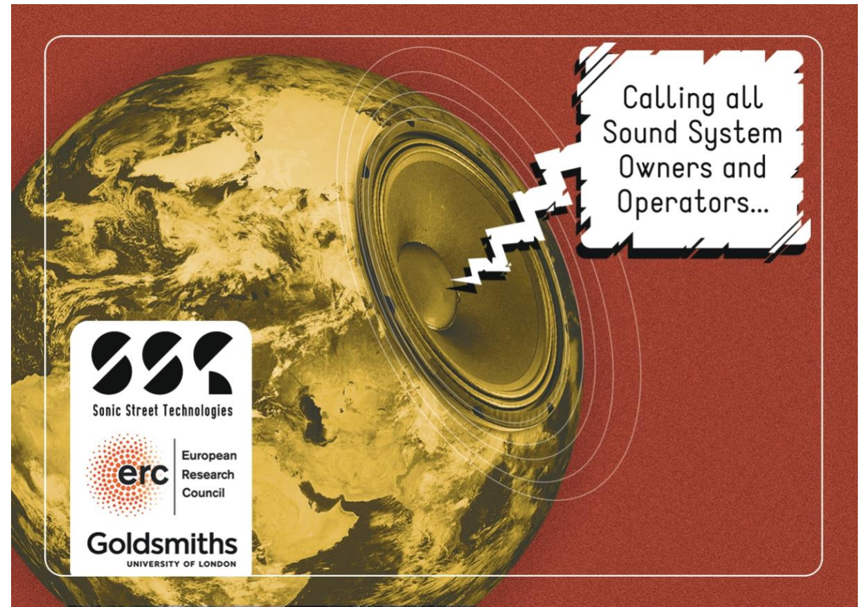
Sonic Street Technologies: postcard invitation to fill in the Sonic Map questionnaire.