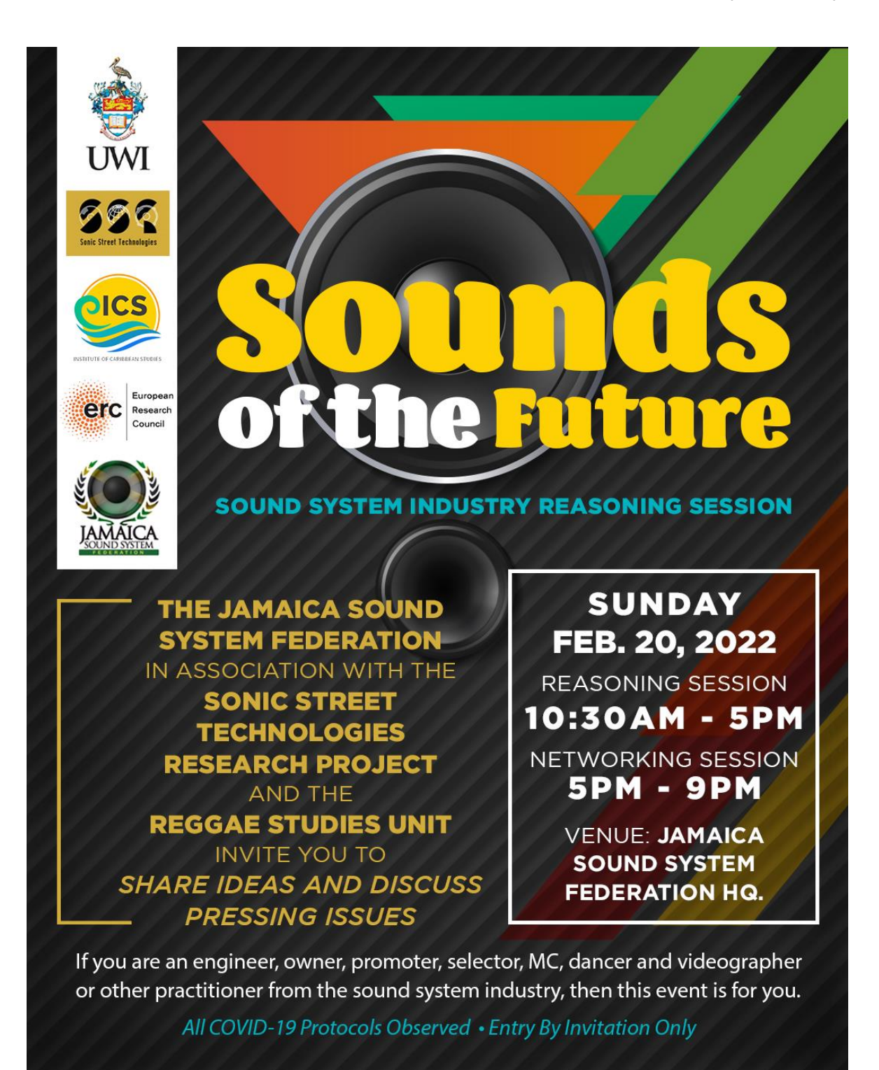
Sounds of the Future: Sound System Industry Reasoning Session poster/flyer, February 20, 2022.

This article frames the day's event as an exercise in practice-based research (PBR), where the practice is that of sound system operations and the research is into the practitioners' ways of knowing. We discuss the theoretical as well as practical and political implications of a PBR methodology having as its subject the popular culture of the Jamaican dancehall sound system scene as an example of the kind of apparatus for playing recorded music—called in our research "sonic street technologies"—to be found across the Global South. PBR cannot tell other than an "inside story" of a particular scene or event, in marked contrast to the typical corporate consultants' report.<sup>3</sup> We argue that this is particularly important with marginalized, that is, subaltern, popular cultures whose knowledge systems are situated and largely embodied and oral.