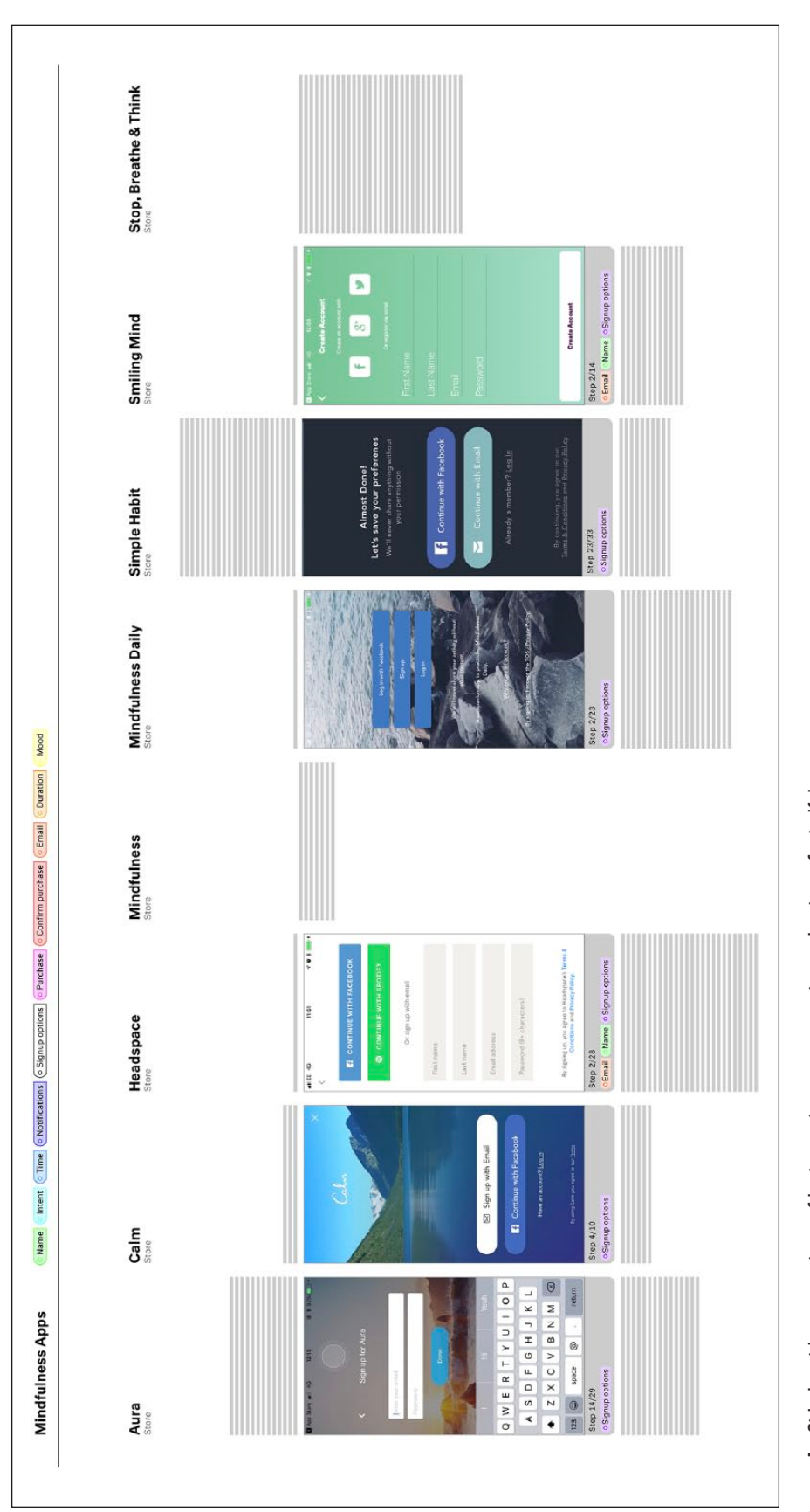
Figure 1. Side-by-side comparison of login or sign-up screens in a selection of mindfulness apps.