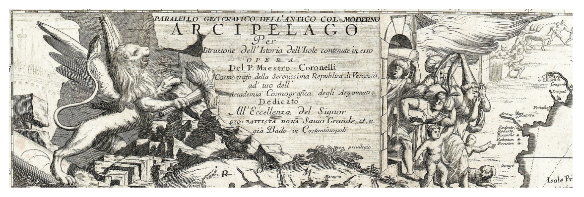
Fig. 12.2. Vincenzo Maria Coronelli, Parallelo geografico dell'antico col moderno Arcipelago (detail), in Coronelli, Isolario (Venice, 1696). Biblioteca della Fondazione Querini Stampalia, Venice.