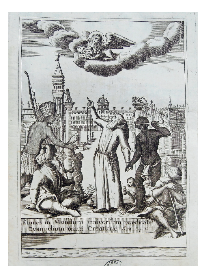
Fig. 12.1. Giacomo Ruffoni, Antiporta, in Dionigio Carli, Il moro trasportato nell'inclita città di Venetia, overo curioso racconto de costumi, riti e religione de popoli dell'Africa, America, Asia et Europa (Bassano: Gio. Antonio Remondini, 1687). Biblioteca Nazionale Marciana, Venice.