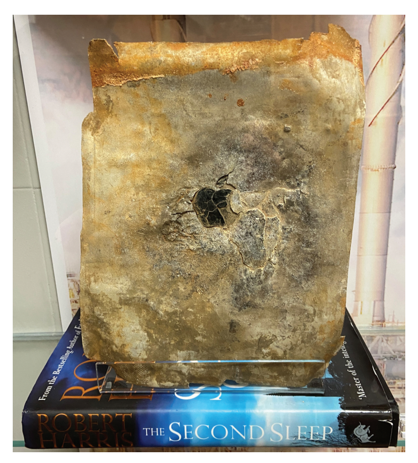
Figure 5. Exhibit 8, Archaeological remains of an iPad temporary exhibition at UCL Institute of Archaeology and Slade School of Fine Art, January-September 2022; 'Objects of the Misanthropocene: a time-travelling exhibition from the Illegal museum of Beyond' (https://www.illegalmuseumofbeyond.co.uk/ioa-slade-exhibition) (Sully et al. 2020).

The speculative insouciant method of the time travelling exhibit relies on the believability of the future world and the credibility of the exhibit to a contemporary audience. Mulgan explores the moral implications of broken futures in a series of publications that utilise a certain understanding