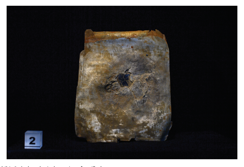
Figure 6a. Exhibit 2. Archaeological remains of an iPad.

"Archaeological Remains of an iPad, Addicott St. George, Wessex, Year of Our Risen Lord 1468 (0003493 CE). The serpent's apple with a bite taken out of it, commonly found on a range of pre-Apocalypse relics, was once the defining symbol of arrogance and blasphemy. For a long period, possession of such criminal objects ran counter to the doctrine of the church and were punishable by harsh ecclesiastical court justice. 'Ye shall not eat of it, neither shall yet touch it, lest ye die'. (Genesis 3:3 in Harris 2019, 55). IMoB 2109.7 (see Figure 6a&b).