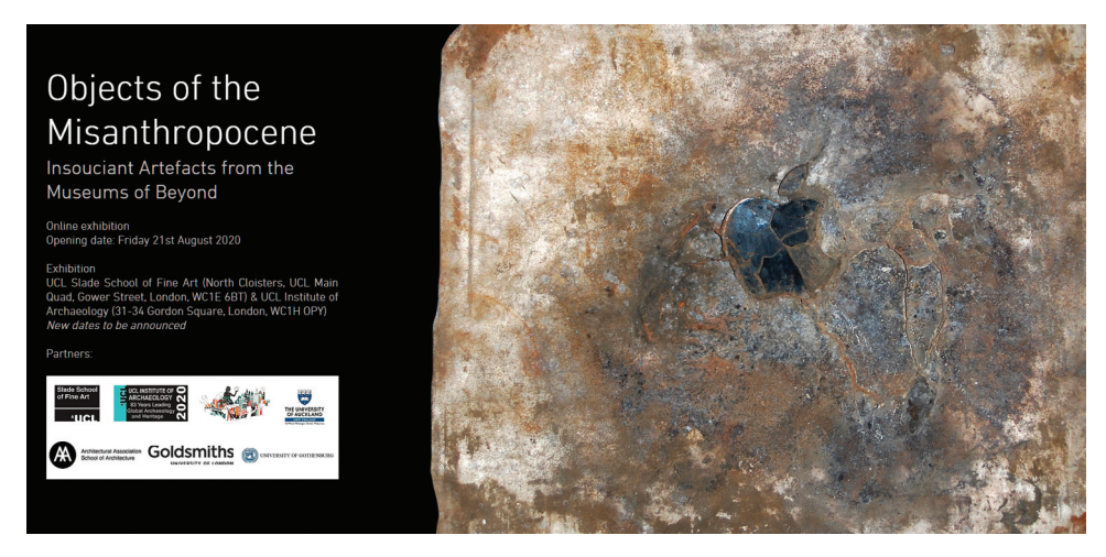
Figure 3. Objects of the Misanthropocene, a time travelling exhibition of insouciant Objects from the museum of Beyond online exhibition, August 2020 (Sully et al. 2020).

a time travelling exhibition of objects from the future of the Anthropocene. The museum collections reflect objects that inhabit specific dystopian futures/other worlds, selected from fictional and nonfictional accounts of the Misanthropocene (published literature, film, music, gaming, etc.) presenting existence in various future, alternative, parallel, multiverses. Situating museum speculations in environmental humanities and ecocriticism of the Anthropocene provides a retrospective critical gaze on our uncertain present, from the perspective of a certain future (Dupuy 2007; Haraway 2015; Mulgan 2011).