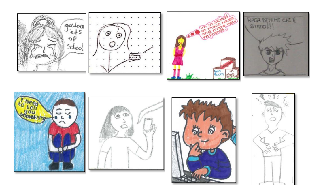
Figure 4. Examples of cybervictims' emotions. From left to right in both rows, Sadness, Surprise, Joy, Anger. The phrase "Gewwon iets op school" means "Just something at school"; the sentence "Raga ditemi chi è stato!!!" means "Guys tell me who did it!!!".