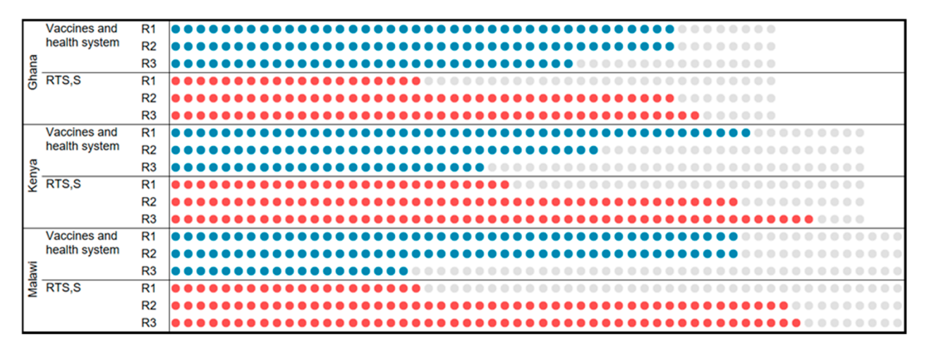
Figure 3. Caregiver expressions of general vaccine and RTS,S-specific trust by country and interview round. Blue dot: caregiver expressed general trust in vaccines or health systems one or more times during the interview. Red dot: caregiver expressed specific trust in RTS,S one or more times during the interview. Grey dot: no general or RTS,S-specific trust codes assigned.

Box 1. Typical RTS,S trust trajectory (K_C18_002).