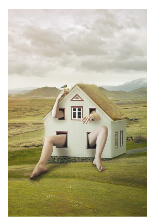
Figure 5.3: 'Confinement' by Orane Tasky

around its halls of residence in November 2020, with a single point of entry and exit to enable ID checks on students accessing or leaving their accommodation, students protesting held up signs including 'HMP University of Manchester', 'HMP Fallowfield' and 'students in cages' (Abbit 2020).