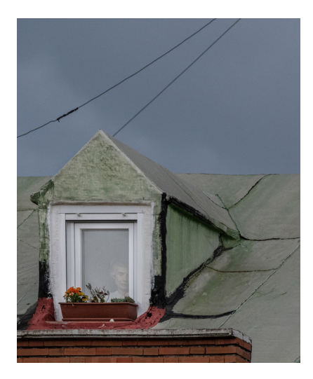
Figure 5.4: 'Woman at Window' by Inés Velasco

These works not only acknowledge that the confinement of the body can be imaginatively transcended in fantasy; they also subtly reinforce the necessity of that bodily confinement. I have written elsewhere that media reporting of cases of 'queue-jumping' at shops by people also prosecuted for criminal breaches of the COVID Regulations is indicative of the emergence of a strong normative code regarding movement in public places. In the pandemic, 'good' movements have come to mean movements that are patient, unhurried, in step with others. By contrast, movements that fall out of that common step betray a lack of decent self-restraint and forbearance. The latter may not necessarily constitute a breach of the regulations on social distancing, but they certainly lend a justificatory rationale for