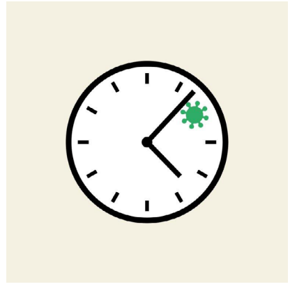
Figure 5.1: 'Covid Time' by Santi Graph