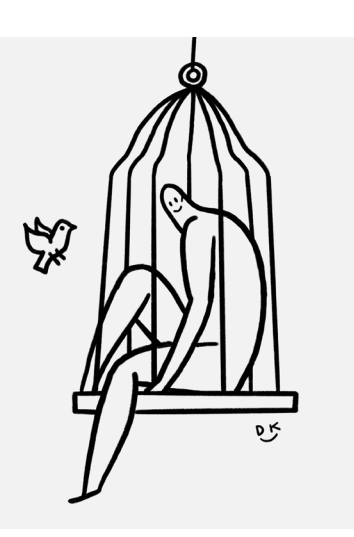
Figure 5.5: 'COVID Cage' by Denis Kakazu Kushiyama