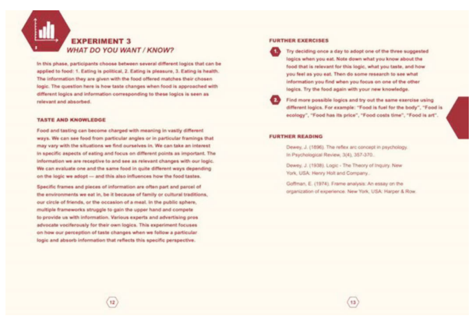
Figure 3: Excerpt of our booklet.

At the end, we gave participants a booklet containing background information, further ideas, exercises and experiments to continue the topics of the exhibition at home (Figure 3).