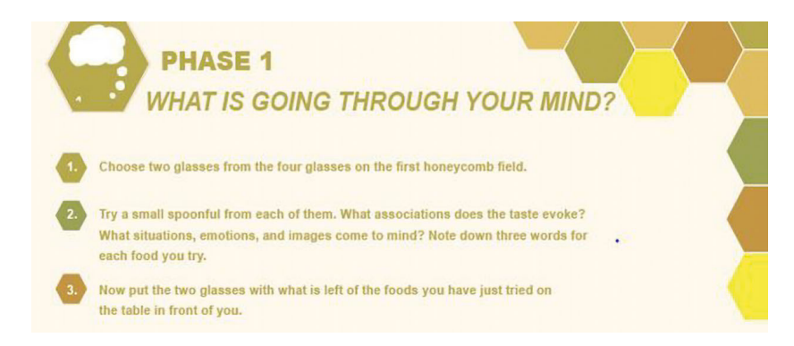
Figure 2: In every phase, the form gave instructions on how to conduct the experiments.