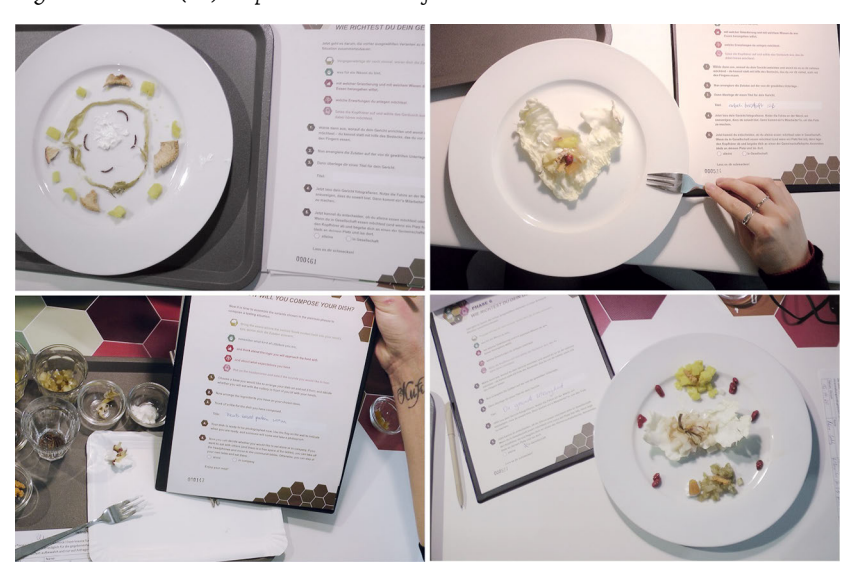
Figure 6: Creative (re-)compositions with a self-chosen title.