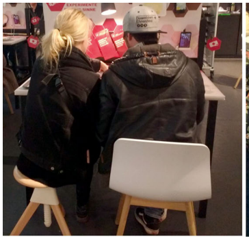
Figure 4: Experimenting in public.