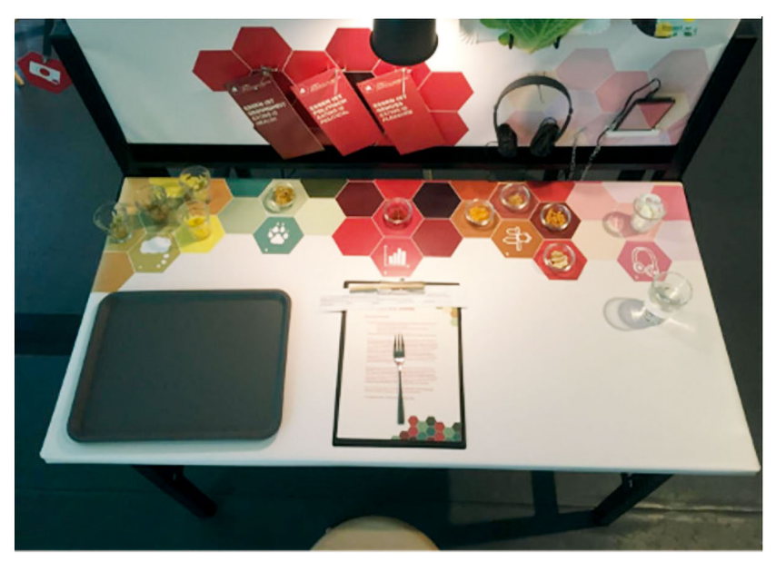
Figure 1: At the experimental station each phase is marked by a symbol, a color and a corresponding field on the table with utensils and ingredients.

is the moment of creatively composing not only a dish, but a situation, and to realize the taste experience that it generates.