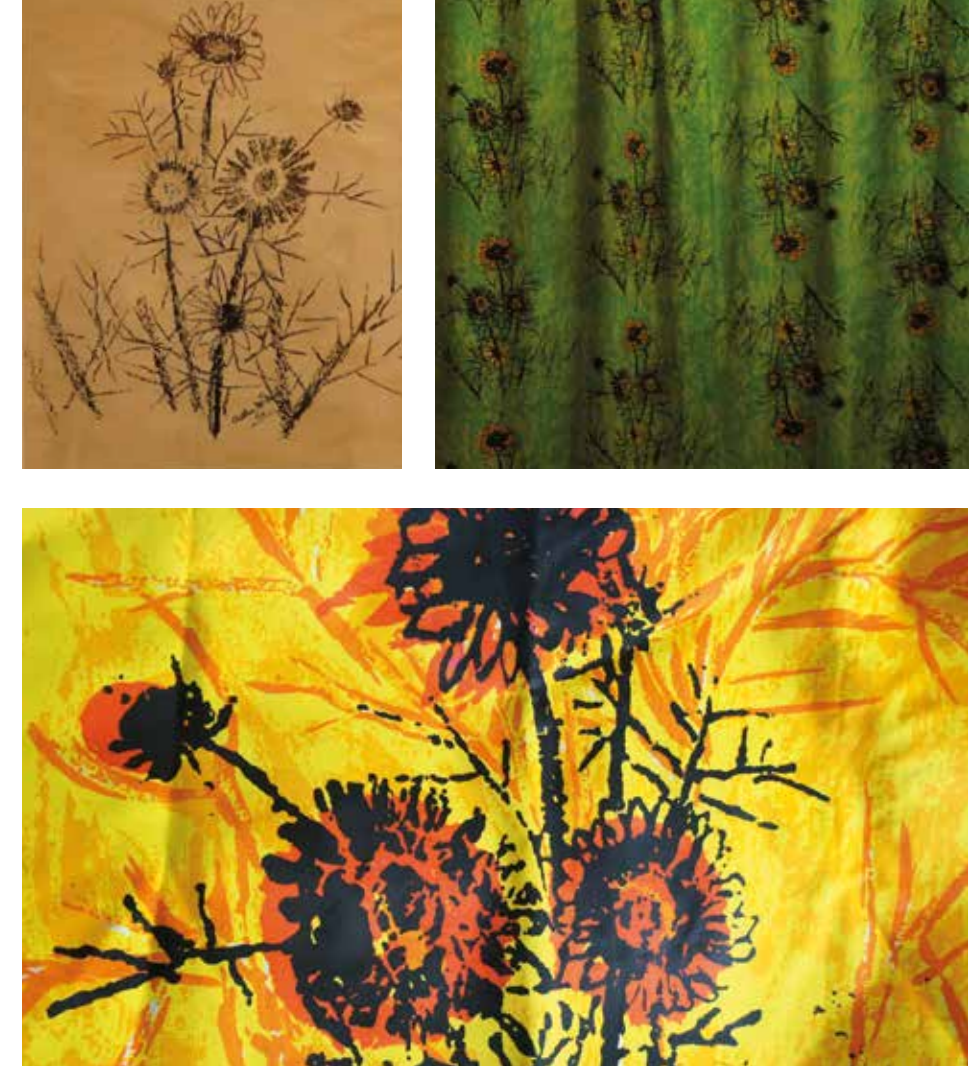
All Photos taken at The Whitworth Art Gallery, Manchester, 2022–23.