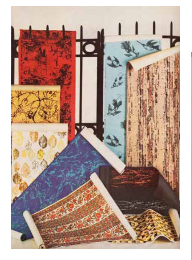
4. Ideal Home Magazine, March 1961. This edition features Crystalline wallpaper design by Althea McNish for WPM. Museum of Domestic Design and Architecture.

5. Crystalline Designed by Althea McNish for WPM (1960), in four colourways.