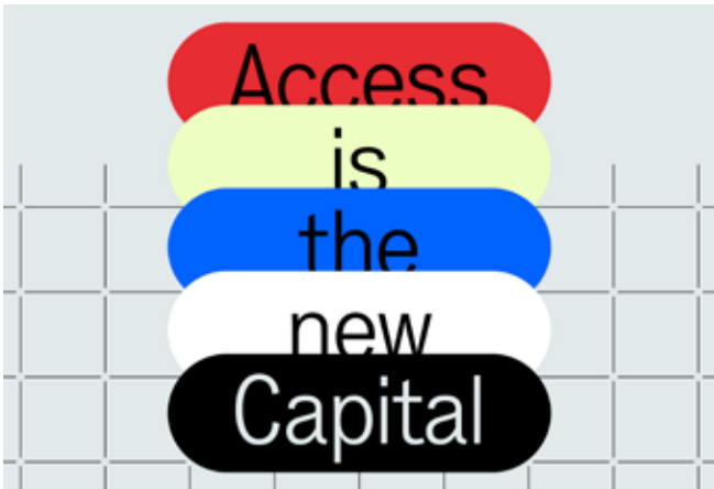
Platform Austria, slogan, Centre for Global Architecture, 2020. Graphic design: Bueronardin. © Platform Austria