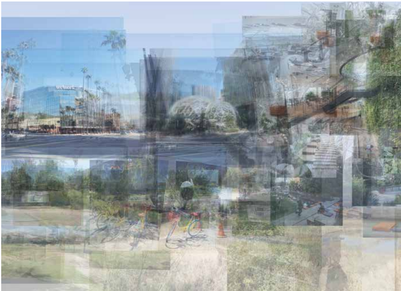
Platform Urbanism – onstage/offstage, 2020.