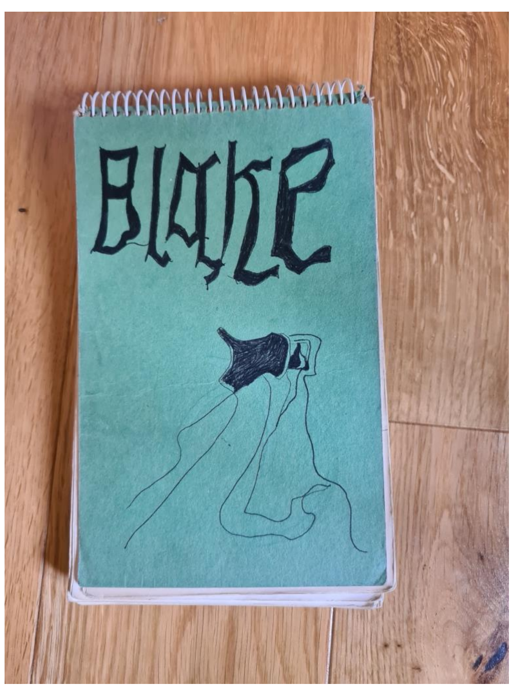
A notebook I wrote when I was 20 years old in 1988.

Now these notebooks have become part of my memory, because I itemised the minutiae of my lived experiences.