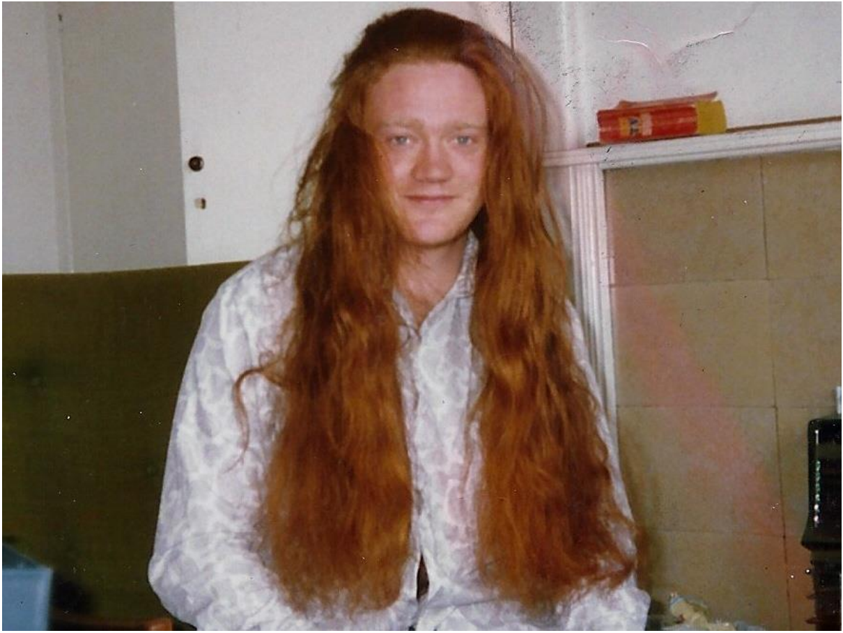
A photo of me taken by my brother in 1989 when I had grown my hair for three years and was writing a lot notes in my notebooks.