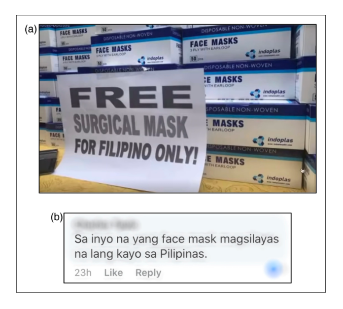
Figure 2(a) and (b). (a) A Facebook photo featuring facemasks that Chinese businesspeople were giving away for free to residents of Manila; (b) A Facebook comment on the photo in Figure 2(a)