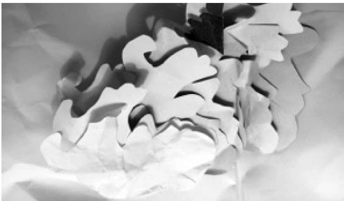
Videostill of LAYERS, 4:00 MIN, silent