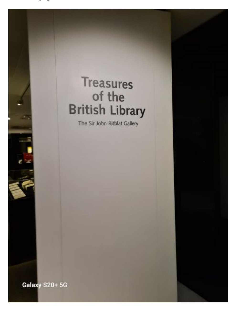
Figure 1 The gallery where many of our writers sought their inspirations!

great success. This is partly because of the diversity of people who sign up for the event; a parent with her three young children who are 6, 8 and 12 years old; a GCSE student with her mother wanting to learn more about writing; a few students, adults and teachers interested in developing their creativity skills; a published writer. They have come from all walks of life, but are united by their interest in creative writing. The British Library proves to be a welcoming space for them.