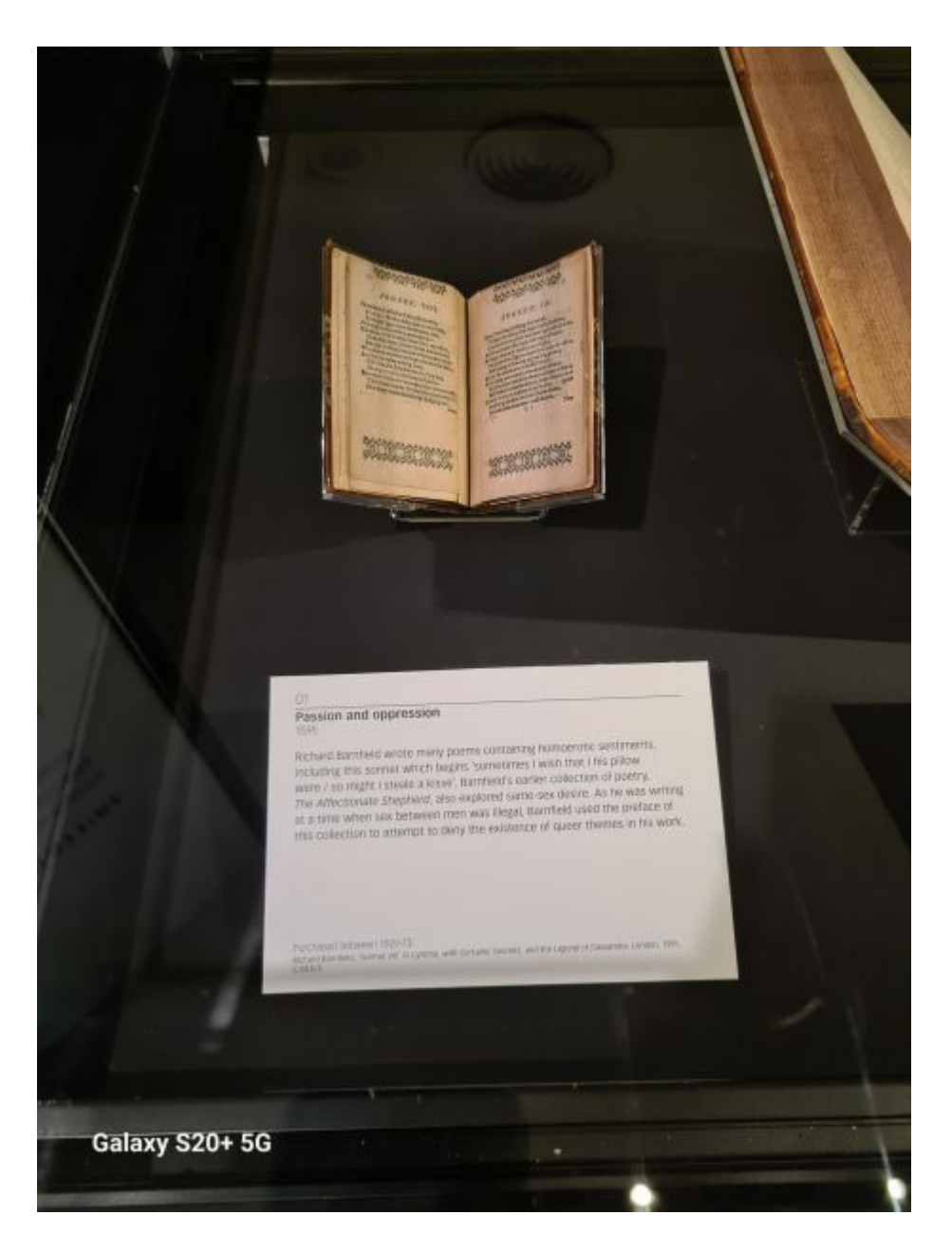
Figure 3 The poem 'Sometimes I wish...' in the British Library

Another participant wrote 'I feel as though this experience has been a reminder that you can explore different regions of the world, past and present, and that it allow you to enter another time, and learn that those stories really do shapre our views today.'