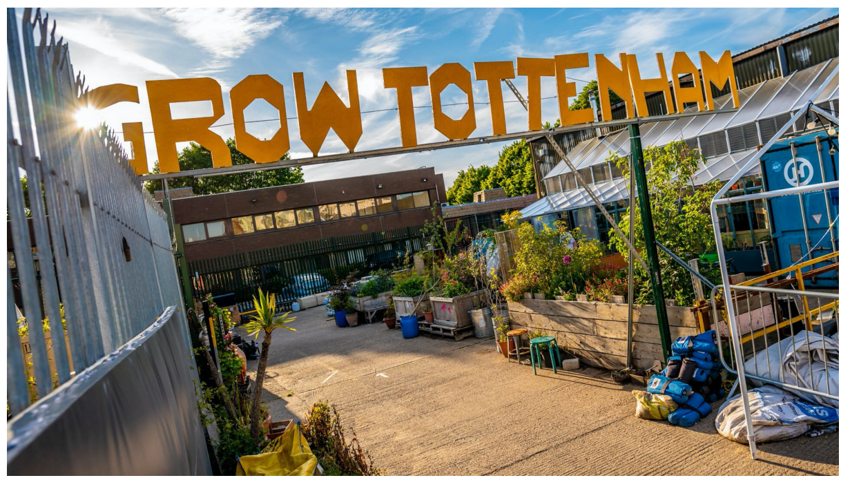
Fig 2.1 Grow Tottenham.

hosting community meetings or ceramics workshops. At others, it would be thick with cigarette smoke and filled with sweaty, reclining bodies.