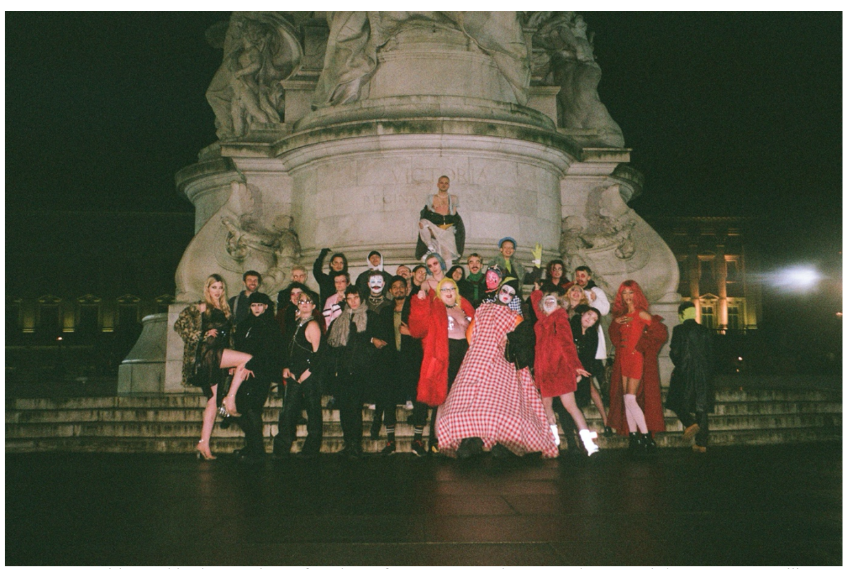
Fig 4.1 Outside Buckingham Palace after the Inferno event at the ICA.

media platform's possible political agenda in discrediting the state of UK culture more broadly, the article demonstrates the ways in which cultural institutions continue to be contested sites, in which perceived transformations can result in 'conflict and negotiation' (Dubin 2011: 478).