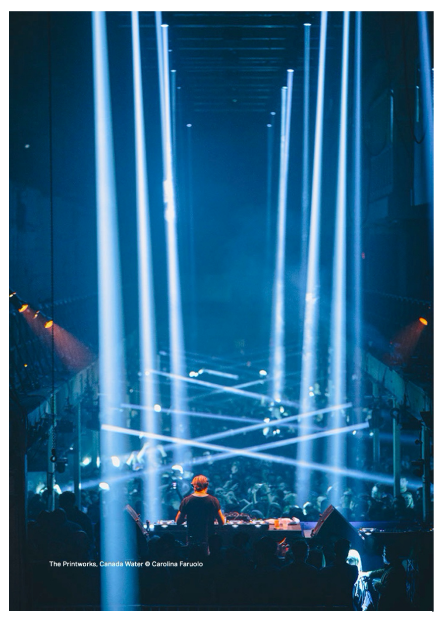
Fig 2.2 Printworks, from 'A Vision for a 24-hour City'.

tendencies draw attention to the emergence of an increasingly corporatised industry, operating at the intersections of venue management, nightlife promotion, and the market-led transformation of urban space.