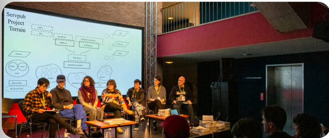
Research Workshop 2024 – Presentation