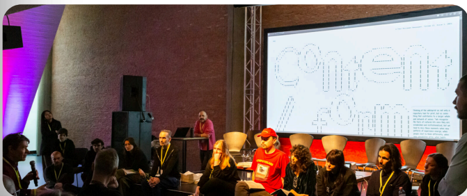
Research Workshop 2024 – Presentation