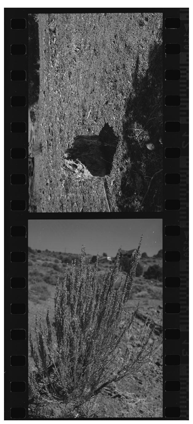
Figure 1 Image from "Parallel Archives: Photographic Silver and Its Landscapes" by Alice Cazenave.

local plants appear overexposed and, at times, granulated. The silver prints made digital scans point to practices of production extant of any care for archival standards or immaculate aesthetic objectives. Instead, they emphasize another kind of attentiveness, a form of ecological care sensitive to the chemical and material afterlives of silver extraction. In doing so, they accentuate the materiality of analogue photography, directing our attention to something beyond the image: to local ecologies, to intersecting chemical and botanical histories, to the legacies of settler-colonialism and its entanglements with image-making technologies and practices. Overlapping images—historical photographs, maps, color digital snaps, and prints produced with plant-based chemicals—tell complex histories of toxicity,