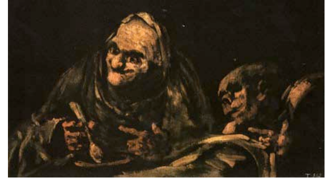
Figure 1: Goya: Two Old People Eating Soup

are not new, nor are they confined to popular culture.