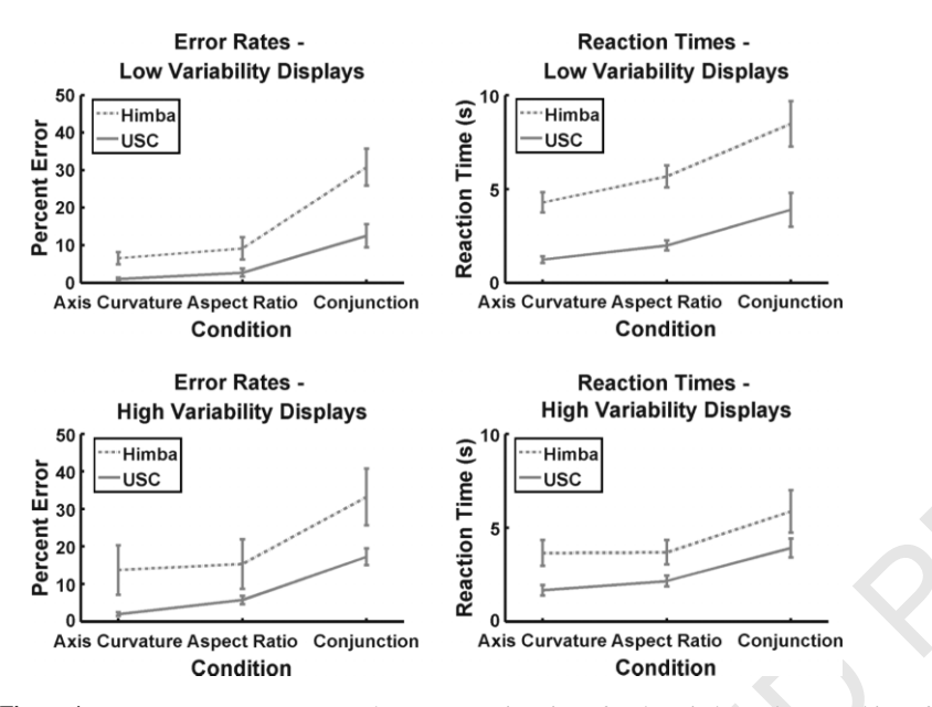
Figure 4. Mean percentage errors and correct reaction times for the Himba and USC subjects for the single and conjunction conditions in the low- and high-variability tasks.

Because only two of the Himba were run on both the high- and lowvariability display conditions, whereas all of the western subjects performed both levels of the task, a single ANOVA encompassing all the data at both noise levels could not be run. The reported F -values are those for the highvariability displays. An ANOVA run on the low-variability displays (and the data from those subjects who quit only part-way through, or for whom we only have training data) gave the same picture: All subjects showed a conjunction cost. For the excluded subjects, the single-dimension conditions' mean error rate was 23.9% and the mean RT was 10.20 s. For the conjunction condition, the mean error rate was 42.8% and the mean RT was 15.90 s.