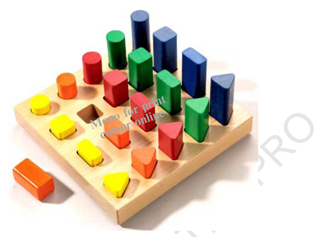
Figure 1. A "shape sorter" in which cross-section shape and aspect ratio (correlated with colour in this sorter) are varied independently (Haba Shape Sorter Board). To view this figure in colour, please see the online issue of the Journal.

toy for toddlers is a "shape sorter" (Figure 1) in which separate dimensions, cross-section shape, and aspect ratio (correlated with colour for the toy in the image) are varied independently. It is possible that exposure to dimensional variation in such simple shapes facilitates the learning of independent shape dimensions. Supporting such a view are the reports of Schyns and Murphy (1994) and Schyns and Rodet (1997) suggesting that the features that we use for responding to our visual world are not fixed but flexible, reflecting our categorization needs. Consistent with the idea of encoding flexibility, Goldstone (1994) showed that humans can learn to perform fine judgements in one dimension of an integral combination of dimensions (brightness and saturation) without strongly affecting discrimination performance in the other.