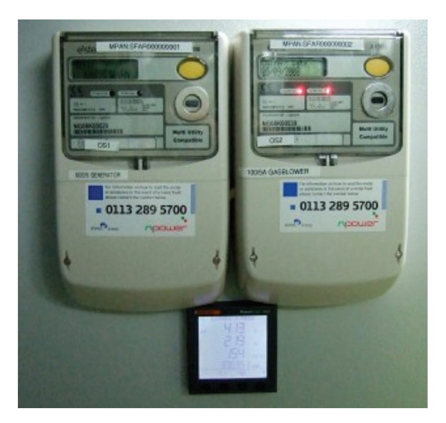
FIGURE 3. ROC meters for a digester.

Because of the epistemological significance of double-entry bookkeeping as a source of demonstration, Poovey situates it as a precursor to the "modern fact." The virtual market in renewable credits is essentially a market in facts—but facts for whom?