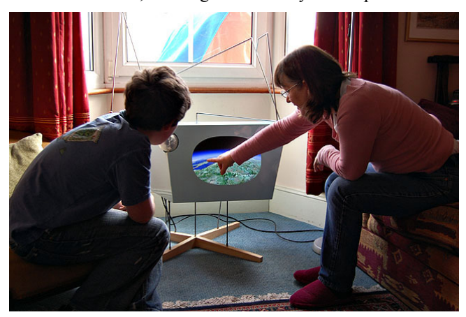
Figure 5. Discussing the Plane Tracker's view.

This example contains a number of interesting and typical features of how the Plane Tracker was used to identify and follow routes. It is typically difficult to identify a location associated with a flight immediately upon the view switching to show it. Features around the distant airport might be taken in (P: "When it went to Dubai you could just about see the palms.") but that is rarely sufficient to enable the location to be identified. As the view pulls out and the flight is recreated, notable shapes are attended to and, if other people are present, often pointed out or queried. Some shapes are familiar (the shape of Cyrpus, the "boot" of Italy, the configuration of blue that is the Great Lakes of North America), others are less recognisable from the view provided ("Is that the Caspian Sea?"). If a preliminary conjecture has been made, an atlas (or the world map that is on wall of the household's entrance hall) may be looked at for further detail. This can give rise to further hypotheses as to the flight's identity (Baku or Krasnovodsk) or suggest other things to look out for as the flight unfolds on screen. In the case noted, P thought it unlikely that a plane would