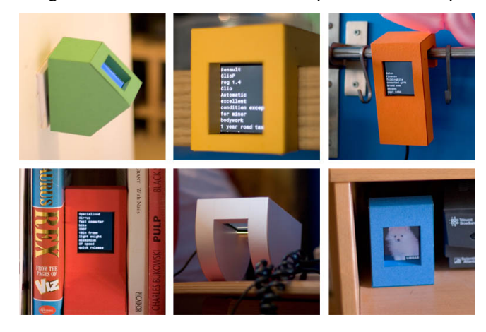
Figure 2. The Local Barometer. Devices were located in the hallway, a shelf in the bedroom office, the kitchen, a living room shelf, the bedside table, and a TV cupboard.

It proved to be extremely difficult to implement small screen devices that could receive text and image data wirelessly and scroll them in the ways we had envisaged. We developed prototypes using a variety of available mobile phone screens and microprocessor boards, even collaborating with our colleagues in the Equator IRC on the design of new hardware which we hoped would underpin