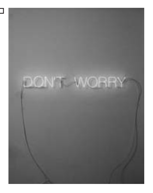
Work No. 239: DON'T WORRY , 2000.

emptied of the social [...] it is the space of a politics of welfare in contemporary art that is an empty space.<sup>6</sup>