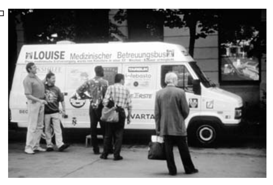
WochenKlausur, Medical Care for Homeless People, Vienna, 1993.

is no difference between artists who do their best to paint pictures and those who do their best to solve social problems with clearly fixed boundaries. The individually selected task, like the painter's self-defined objective, must only be precisely articulated. Interventionist art can only be effective when the problem to be solved is clearly stated.<sup>9</sup>