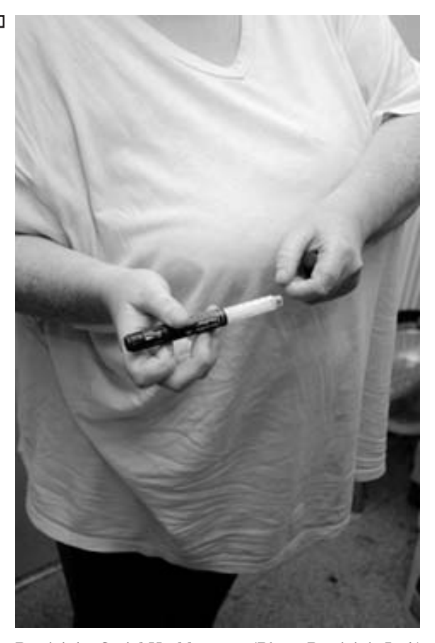
Participle, Social Health, 2011.

Participle's approach is practical and structural. For Social Health they recommend—and lobby for the integration of—conditional change in the institutional framework and monetization of healthcare. Such policy recommendations might include the practical recognition of the financial benefits of supporting emotional, psychological, physical, and social issues for those learning to live with a chronic condition, teaching lifestyle change and self management techniques, and "growing