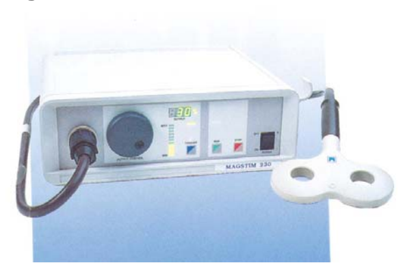
Figure 1. The magnetic stimulator

A photograph of a commercially available magnetic stimulator, consisting of a capacitor and stimulating coil ('figure of eight'). An electric current of up to 8 kA is discharged from the capacitor into the stimulating coil, producing a magnetic pulse of up to 2T. The coil is placed over a region of scalp. The application of a magnetic pulse results in a localized electric field, which transiently disrupts functioning of underlying cortical tissue.