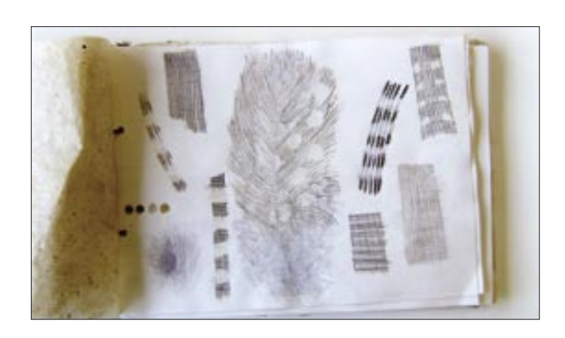
Figure 3 A page from Rezia's sketchbook.

We were supposed to be doing something called the Personal Project. It was different from anything else we had done and was meant to be really personal. I was a bit lost. Then I found myself in this field of dandelions. I knew at once that that was what I