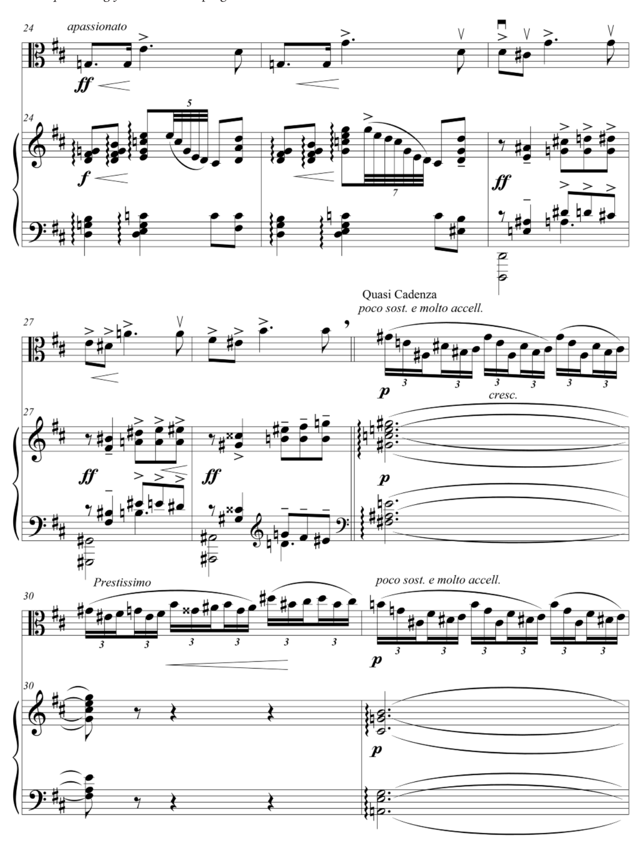
Example 9. Sergey Vasilenko, Sleeping River, mm. 24–31.