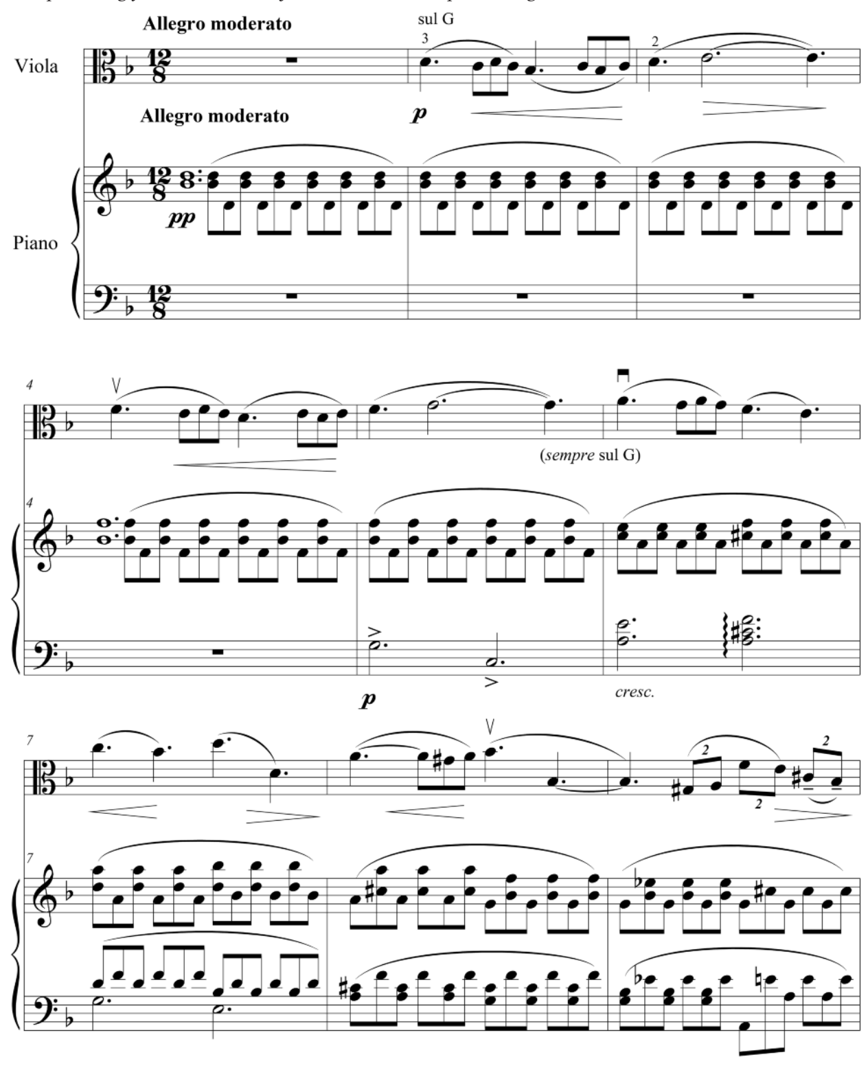
Example 5. Sergey Vasilenko, Sonata for Viola and Piano, op. 23, Allegro moderato, mm. 1–9.

emphasis on rhythm of Neoclassical aesthetics, and the exotic chromatic and modal harmonies of Oriental music combined with the augmented, diminished, and dissonant intervals of Modernism. Such a fusion of contradicting styles is perhaps the