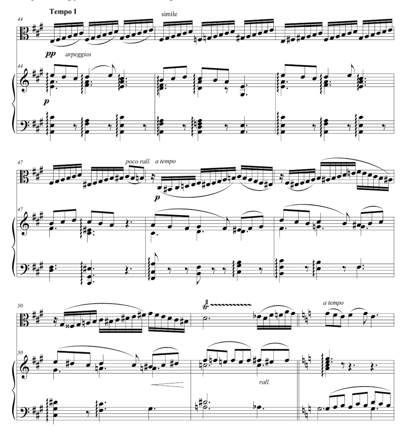
Example 10. Sergey Vasilenko, Four Pieces, Legend, mm. 44-52.

episode that precedes the middle section of a contrasting scherzando character. The return of the first theme is rhythmically and instrumentally unanticipated, though it retains its compound meter of 9/8. The piano leads the melody, while the viola accompanies with ascending scalar chromatic passages in sextuplets (ex. 10). Similar to the Prelude , the theme then breaks into short motifs that dissolve in pianissimo .