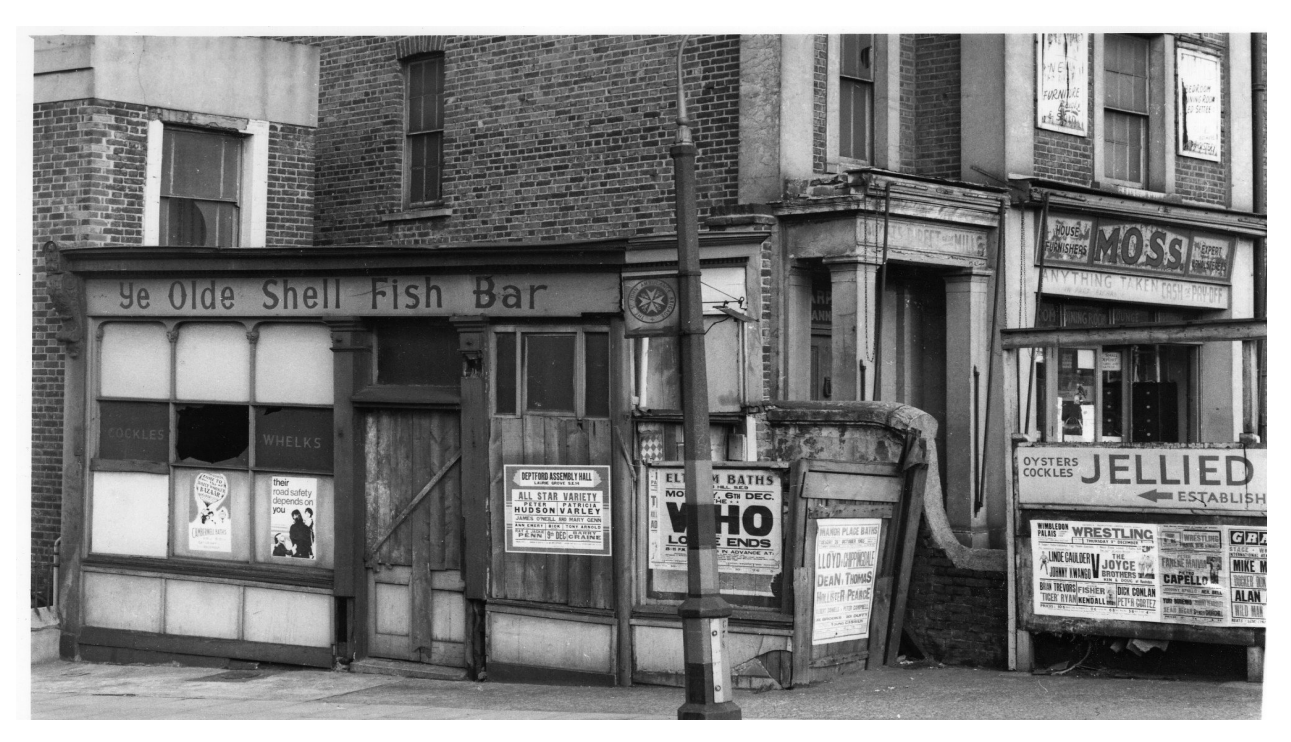
Figure 2. Ye Olde Fish Bar, Circa 1982

clusion within the culinary rhythms of city dwellers remains isolated to small groups. In contrast to previous centuries, distaste and disgust for these morsels is, however, far more commonplace (see Figure 2).