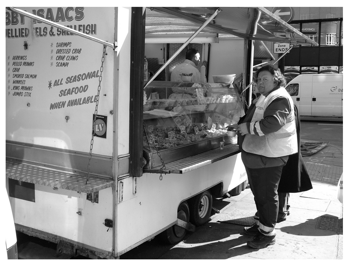
Figure 4. Tubby Isaac's, 2008

Consider this portrait of one Tubby Isaac's most regular types of customers, one of a team of local street cleaners, a warm, familiar and popular character in the neighbourhood (Figure 4). Many of his fellow 'refuse collector-cum-exterior designers,' (Sandu, 2007) visit the stand during or after their shift of scraping and sweeping. In the case of this mixed gaggle of Polish, Caribbean, British and West African labourers, hanging around symbolically 'dirty' space, eating symbolically 'dirty' food, telling symbolically 'dirty' stories, it's essential not to lose sight of the fact that the 'symbolic dirtiness' of their habitus, coincides with really dirty work; handling needles and broken glass through thin rubber gloves, wondering alone on streets mopping up the sludgy residues of the East Ends exploding nighttime economy. Posing far greater personal risk than the 'risks' handled by the financial wizards in the neighbouring city this is work – dished out to members of society often perceived to threaten normative forms of propriety – threatens the very real boundary between life and death. The arresting of the symbolically dirty to real dirt can also be seen in the life of the sex workers whose shifts overlap with those of the area's street cleaners.<sup>2</sup> And of course, labouring both physic-