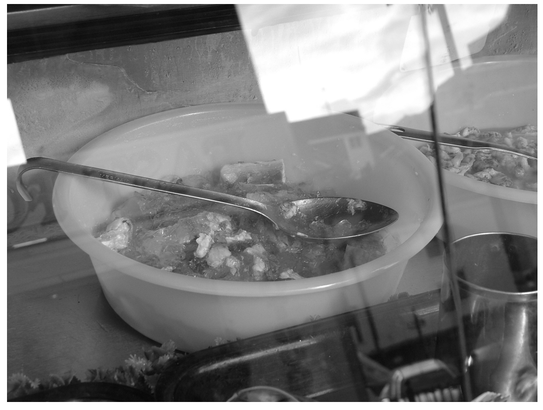
Figure 3. Jellied Eels, Tubby Isaac's, 2008

First, it must be noted that on a general level, any flavour or smell has the potential to turn the stomach. Smells and tastes by their very nature, smudge a very important taxonomic division disturbing, by way of bodily orifices, a simultaneously psychic and physical sense of corporeal 'inside' and 'out' (Grosz 1994, 192-198). It is perhaps because smells and food necessarily disrupts this foundational boundary that Kristeva claims that 'food loathing is ... the most elementary form of abjection' (1982, 4). Yet we know that not all food induces gut-wrenching squirms. Rather, only the movement of certain tastes and textures into the mouth, or smells through the nose, result in the convulsion that ripples from stomach to lips and across the face. The distribution of these squirms, I will argue below, is partially predicated on the particular classificatory systems through which we sort our every day sensory experiences.