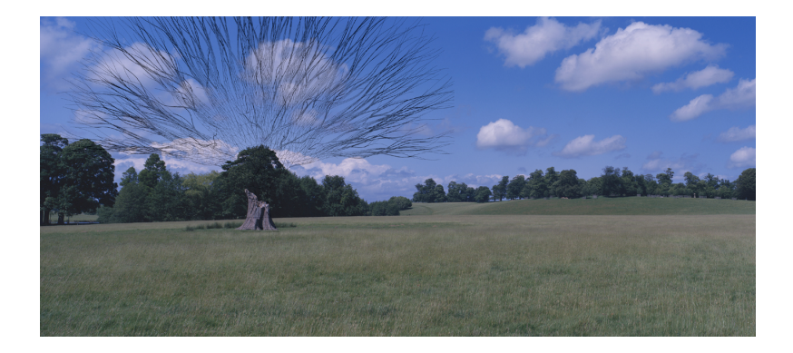
Figure 2 – Tree stump and wireline oak, Petworth House. Duratran 190cm x 85cm. Prophet (2003).

By contrast, in contemporary art practice photographic representations have no automatic truth-status (quite the contrary) and are assumed to be subjective. Many such images made by artists deliberately draw attention to their construction and artifice (see Fig.2). In this image the photographic representation is of the parkland at Petworth House in Sussex, England. The landscape is well known and views of it were painted by Turner. But the landscape formation is not 'natural'. It was constructed by the eighteenth century landscape designer Lancelot 'Capability' Brown, drawing on compositional techniques from contemporaneous landscape painting. Figure 2 is based on a photograph of the park as it is now, with a superimposed digital image of a simulated tree that has been generated using fractal mathematics.