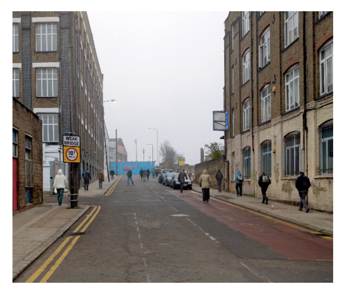
Figure 3. Chris Dorley-Brown, Early Shift Arriving, 2011. Courtesy of the author.

cannot see their faces, only their backs and their heavy, slightly zombie way of walking. This mysterious labour force that is finding its way into the Olympic machine is framed by large warehouses, once industrial buildings and now converted into artists' studios. Looking at the Olympic site from Hackney Wick there is no spell: the prospect of both workers and build structures is uncertain, and the seduction of the Games is muted by the foggy atmosphere.