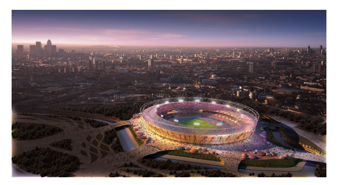
Figure 1. Olympic Stadium.

One of the ODA's most widely distributed images (Fig. 1) presents the preferred view of the Olympic Stadium, an aerial south-facing perspective in which the City and Canary Wharf occupy the edges of the horizon. The rest of the city, essentially nondescript, remains within this triangle of financial capitalism, urban renewal, and more financial capitalism. The soft sunlight comes from the East, suggesting an early morning; the stadium, however, is lit, full of spectators and surrounded by thousands of tiny figures on the bridges leading to it. The grandeur of the aerial perspective, the dissolution of citizenship into spectral forms, and the insistence on a visual connection between the stadium and Canary Wharf are all prevalent elements in the vision of the