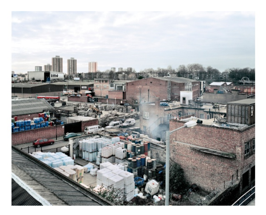
Figure 5. Alessandra Chilá, Hackney Wick, 2007. Courtesy of the author.

and conversation, is in contrast with the seriousness of the man in a suit. His pointing gesture, examined by the younger man next to him, seems to be a warning (of what we cannot be sure: the interest of the City workers, maybe?). Simply by moving the Olympic icon to the background, Dorley-Brown puts it in_relation to the complexity of the local context. The lightness of the CGI promises is bracketed here by the density of these many other stories never told. In fact, Decisive Moments was produced as part of The Cut , a project by [ s p a c e ] which combined photography, oral history, drawings, archival work and community art in an investigation of the 'Hackney Cut', as the area is also known. In addition to an exhibition in summer 2011 and a web presence, the project was disseminated through a free newspaper, in which Dorley-Brown's pictures were printed.