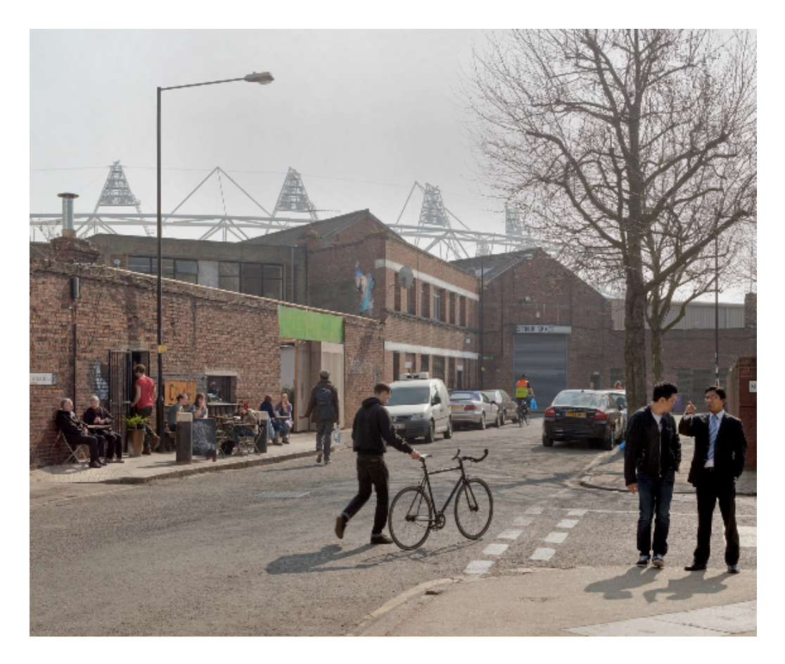
Figure 4. Chris Dorley-Brown, R oach Road, 2011. Courtesy of the author.

the right of the frame. Various cars are parked; among them, a small transport van, a Mercedes convertible and a Volvo. There are three other people further away, walking or cycling. A warehouse with a closed shutter and a sign that reads 'Stour Space' (an art gallery and multi-use space) stands at the end of the road.