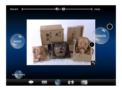
(b) The forum scene for in-depth discussion