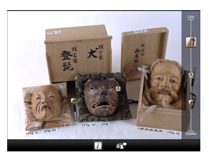
(a) The selection scene for rapid selection of interesting images