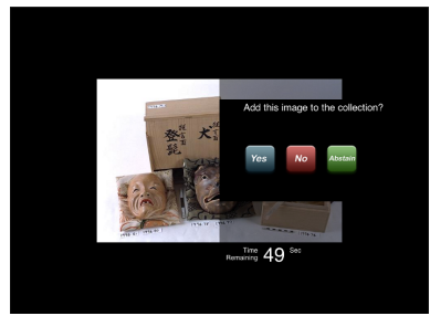
(d) The vote scene for deciding to add images to the group collection