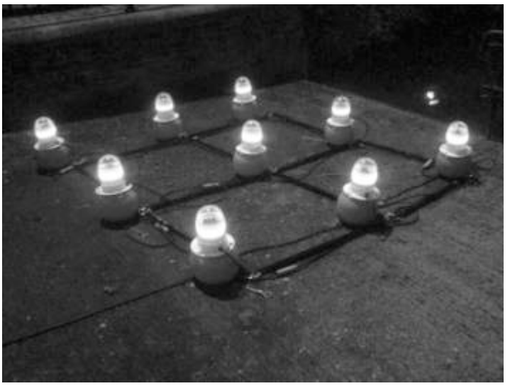
Figure 2: the 3 x 3 buoy Net Work prototype

artistic, computing and engineering skills, was evidenced by the large number of potential solutions offered to software and engineering problems, the subsequent high level debate, and the speed at which the research cluster solved many of the challenges associated with building Net Work. The collaborative process led Prophet to further develop and clarify her core idea and the project evolved as collaborators introduced and argued for new elements.