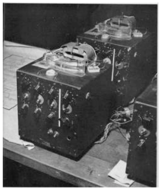
Figure 3: Ashby's four unit homeostat.

Each of the units can be arbitrarily conceptualised as representing the environment or sensorimotor system of an ultrastable mechanism and the electrical interactions between the units therefore model the primary feedback. When a needle deviates outside of its stable bounds, a secondary feedback mechanism is triggered that randomly changes a number of parameters that affect the movement of the magnet. The magnet in each unit is driven by the activity of four coils, each of which is dependent on the settings of an associated commutator and potentiometer. Three of the coils are connected to one of the input connections from a neighbouring unit and the other coil is connected to the recurrent connection. The polarity of each input, including the self-connection, is determined by the state of the commutator and the proportion of each input signal reaching its associated coil is determined by the state of the potentiometer. The secondary feedback is implemented by connecting a uniselector to each unit. This device has 25 discrete states, each of which consists of a triple of random values, derived from a standard statistical table. This can be thought of as a look up table with 25 rows and 3 columns which provides random numbers to reconfigure