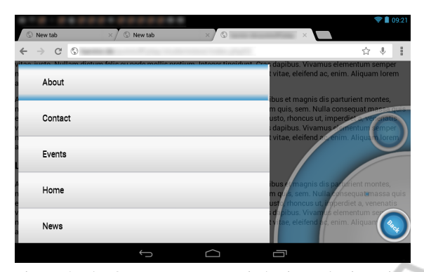
Figure 5: The OHW on a Nexus 7 in horizontal orientation.

text and images that stretch over many screens and would otherwise need scrolling to access, as found on news websites, wikis, forums, blogs and search engines. Benefits for all types of websites include quick access and operation of forms, navigation, and control of audio or video items if supported natively by the browser.