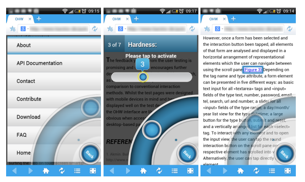
Figure 2: Basic list view of the site navigation (left), an augmented input field of the type range (middle) and the scroll functionality (right).

To implement the OHW, the webmaster only needs to ensure that the jQuery JavaScript library is available on the website before linking to the OHW's code using a basic <script> tag. The webmaster