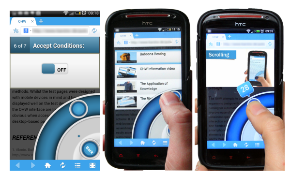
Figure 3: A checkbox input rendered by the OHW, where a tap on the OHW interface toggles the state (left), a user selecting a video from the media menu (middle) and video playback control (right).

list views (Fig. 2) that can hold images and text. In addition it offers on/off switches, sliders, buttons and a media player (Fig. 3, Fig. 4). These views are used in combination for the augmented presentations of otherwise hard to use elements and can be controlled by swiping and tapping. The OHW also provides scroll functionality similar to that of the Opera Mini browser (ASA, 2012). While scrolling, interactive elements closest to the current scroll position are outlined one at a time (Fig. 2) and can be activated by tapping the interface. Text input uses the system keyboard as initial tests showed that users found the OHW's own concentric keyboard hard to use. In addition to the functionality provided, the above can be easily extended by the webmaster by combining a CSS selector, one of the OHW's views and a custom function to suit their needs.