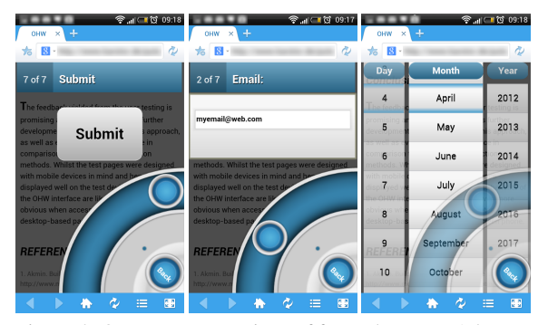
Figure 4: OHW representations of form elements: A button (left), a text input field (middle) and a date field. Users can swipe over the interface to navigate between elements in a form and tap to engage with the active element. Each element can be operated by performing swipe and tap actions on the interface.

After iterative paper prototyping the interface was built and a pilot user test with 11 participants (6 F, all frequent smartphone users) was conducted to identify usability issues and to establish acceptance. Users were given a set of tasks one might perform on a page consisting of headlines, forms, videos, navigation and links, which they completed using the OHW without assistance. The page was designed to be deviceindependent using CSS3 media queries. All actions were recorded in video and audio, and feedback was given in a questionnaire on a five-point Likert scale. Feedback was predominantly positive and in response to the collected data we created an improved version of the interface for a usability study determining the efficiency and speed of the OHW in comparison to the normal operation (with one hand without the OHW) of a mobile-optimised website. During a demo ses-