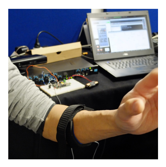
Figure 2: The EMG/MMG armbands.

<sup>3</sup>http://www.musicsensorsemotion.com/2010/03/08/ sarcduino/