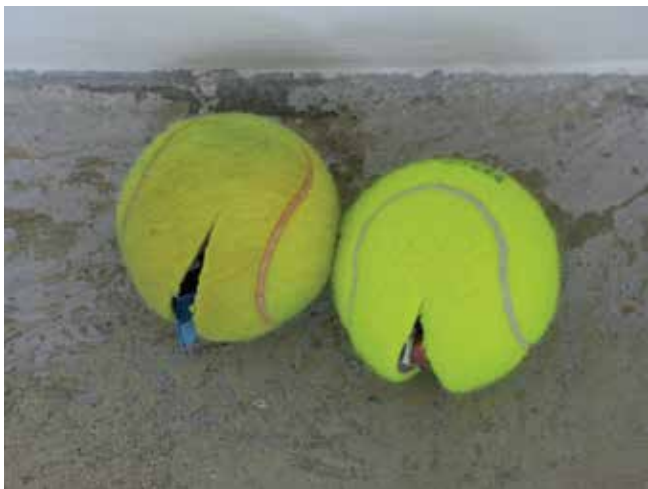
Claire Fontaine, Untitled (Tennis ball sculpture) , 2008