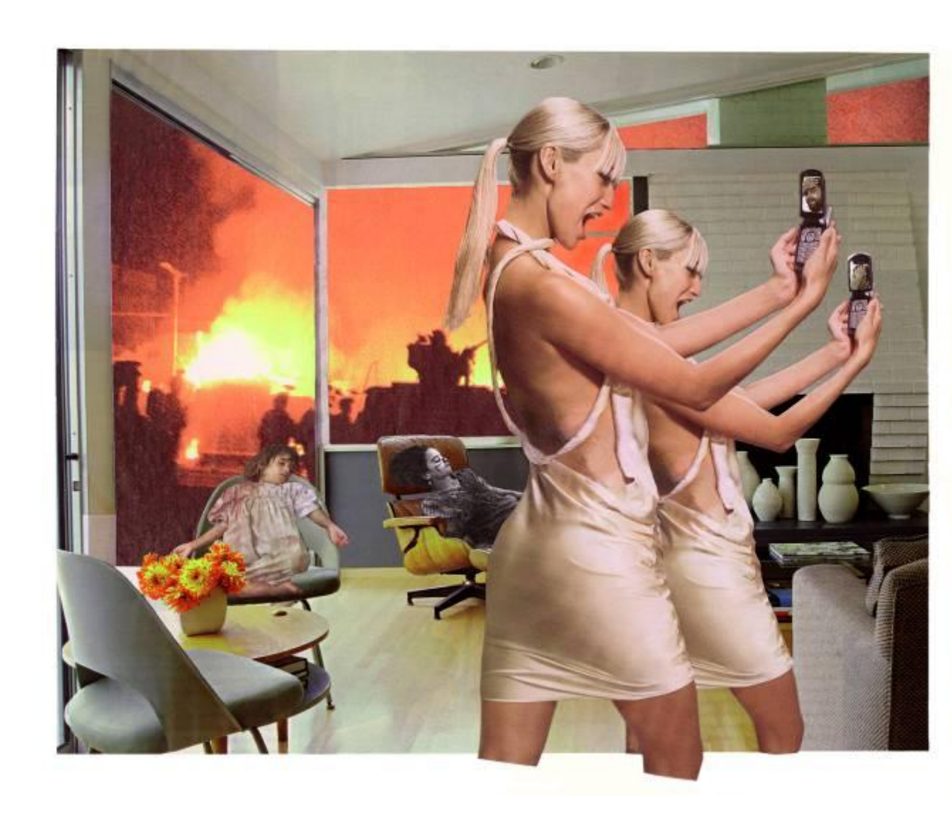
Fig. 5 Martha Rosler, Bringing the War Home: House Beautiful, new series, 2004, Photo Op