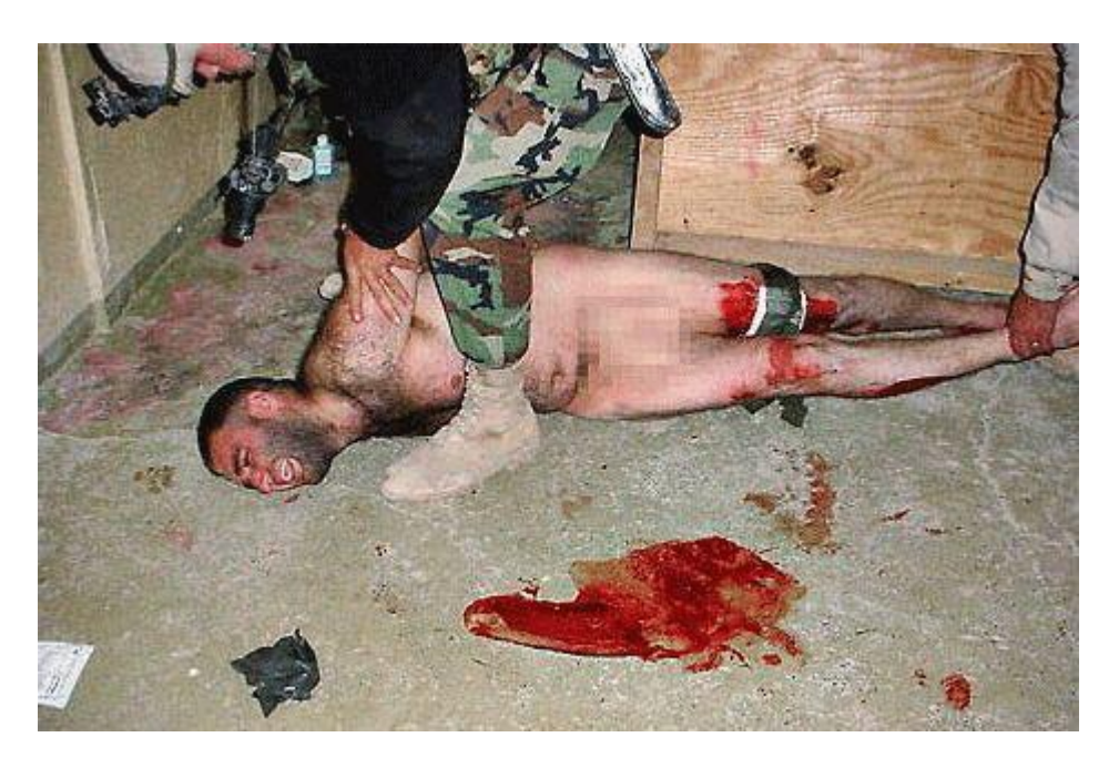
Fig. 14 Torture in Abu Ghraib camp, Baghdad, 2003