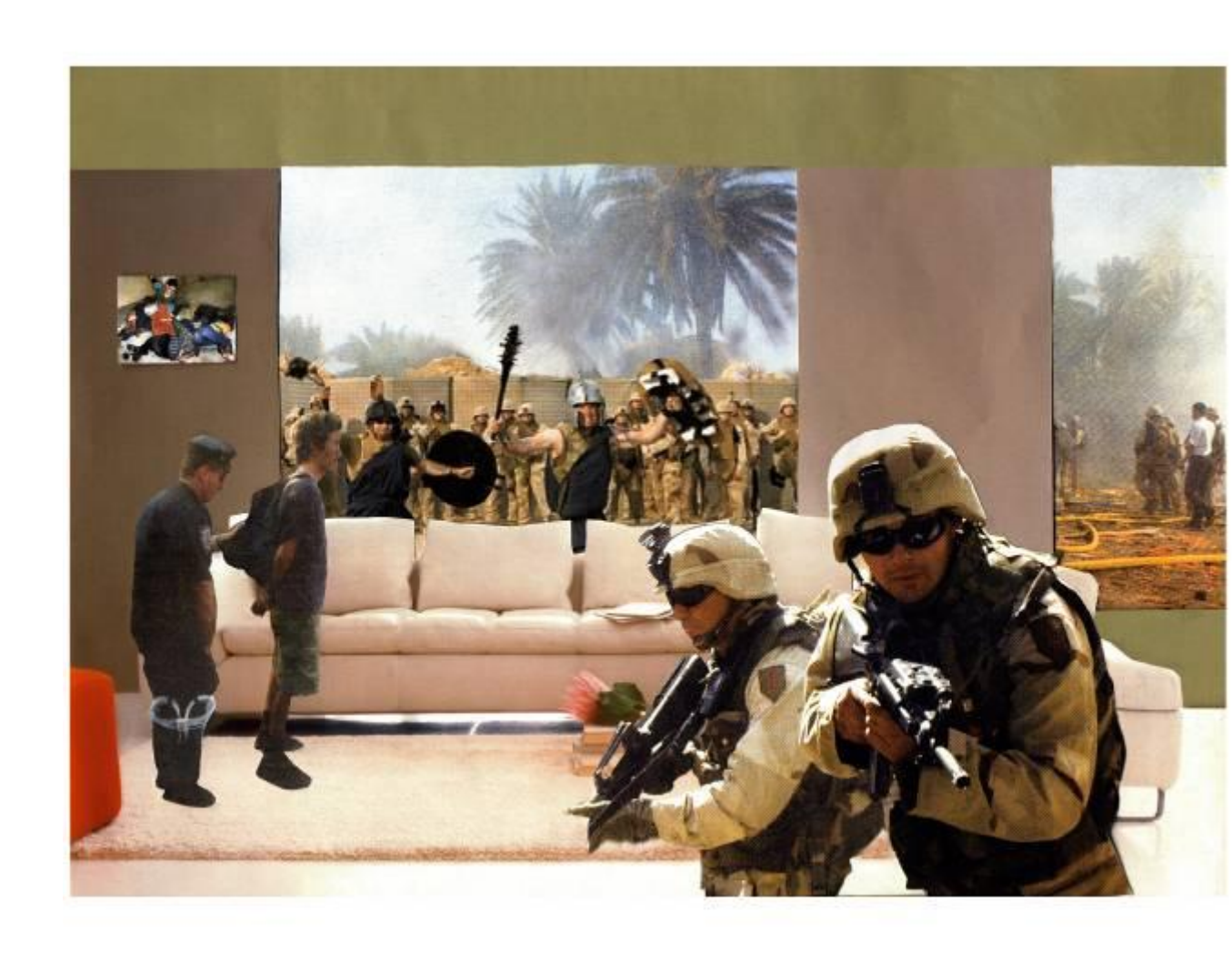
Fig. 2 Martha Rosler, Bringing the War Home: House Beautiful, new series, 2004, Gladiators