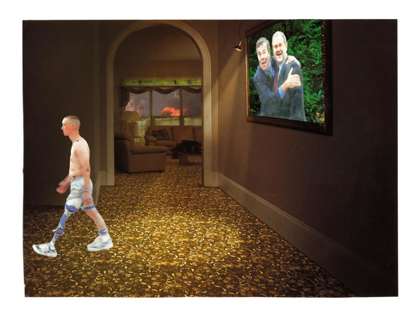
Fig. 3 Martha Rosler, Bringing the War Home: House Beautiful, new series, 2004, Amputee, Election