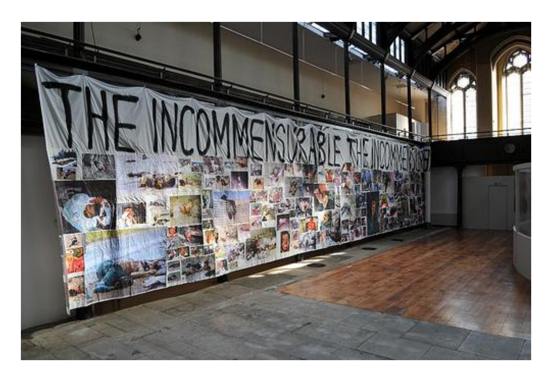
Fig. 23 Thomas Hirschhorn, The Incommensurable Banner , 2008 Brighton Photo Biennial