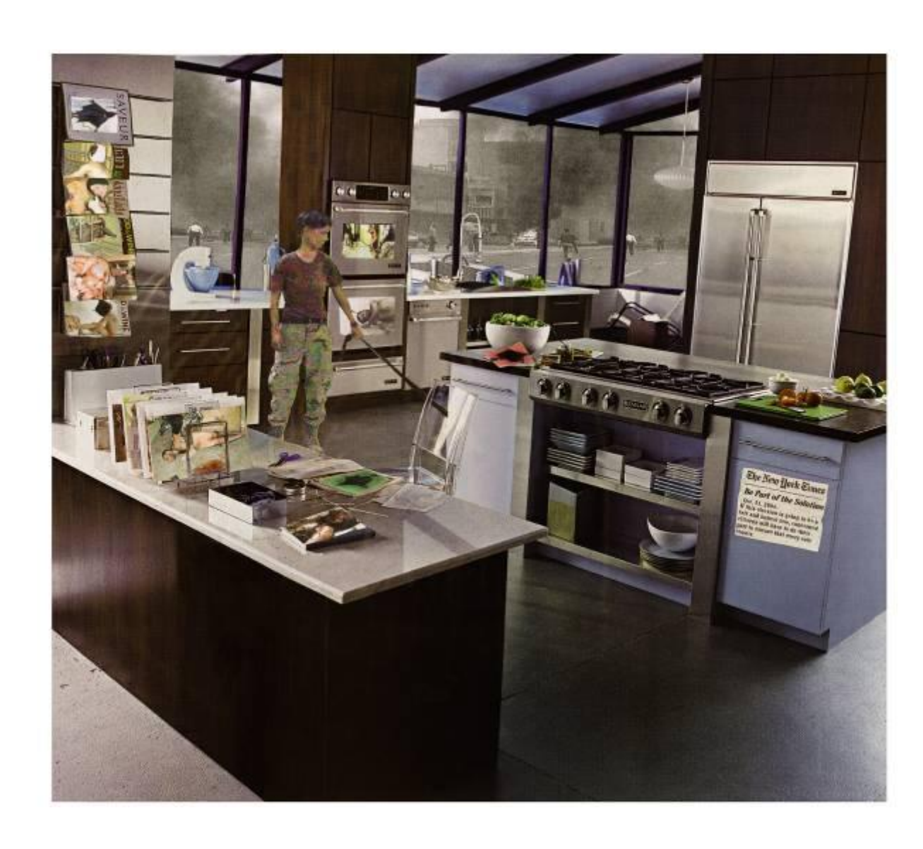
Fig. 1 Martha Rosler, Bringing the War Home: House Beautiful , new series, 2004, Election, Lynndie (Courtesy of the artist)