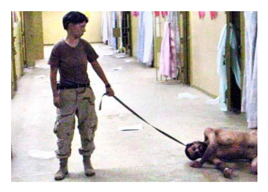
Fig. 7 Lynndie England and prisoner on a leash, Abu Ghraib Prison, Baghdad, October 25, 2003