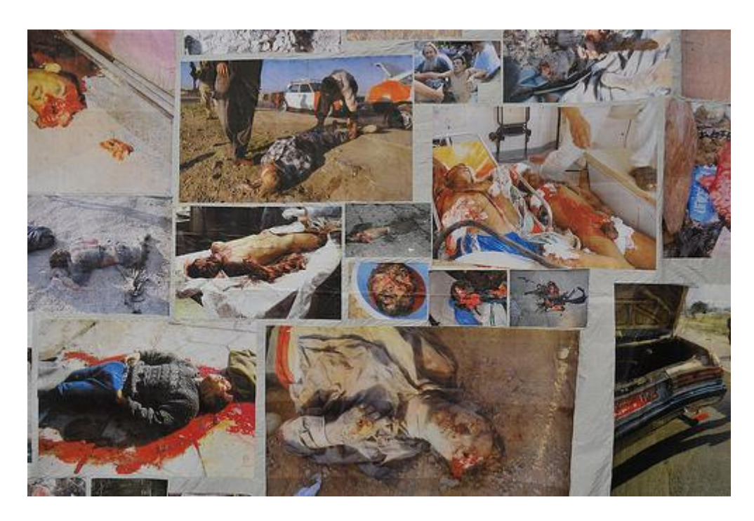
Fig. 24 Thomas Hirschhorn, The Incommensurable Banner , 2008 Brighton Photo Biennial (detail)