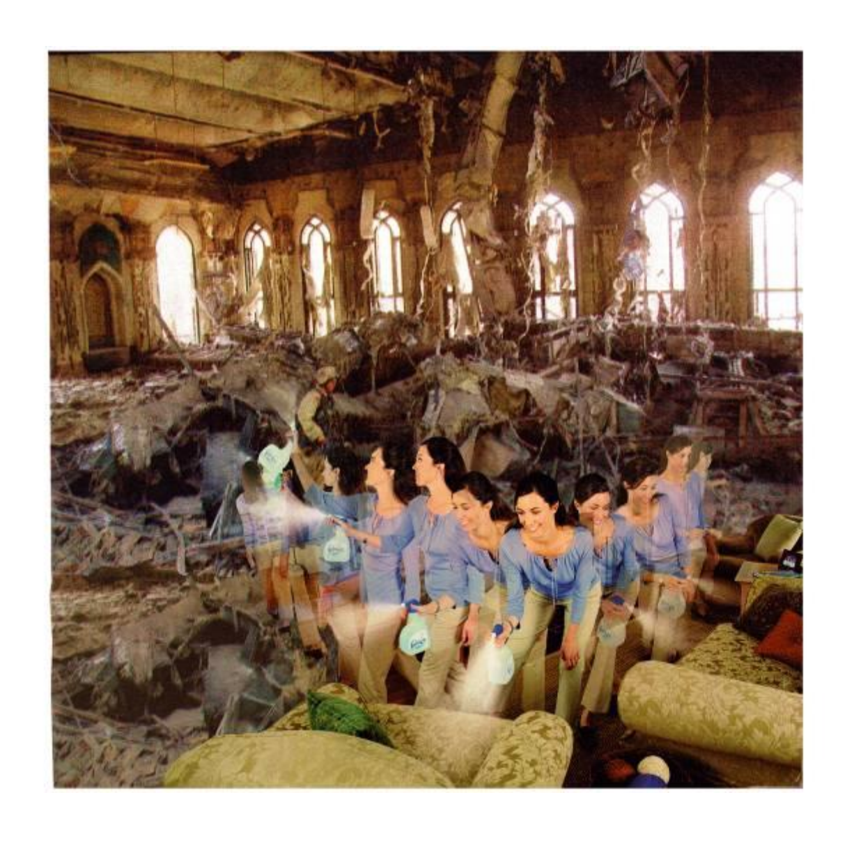
Fig. 6 Martha Rosler, Bringing the War Home: House Beautiful, new series, 2004, Saddam's Palace, Frebreze