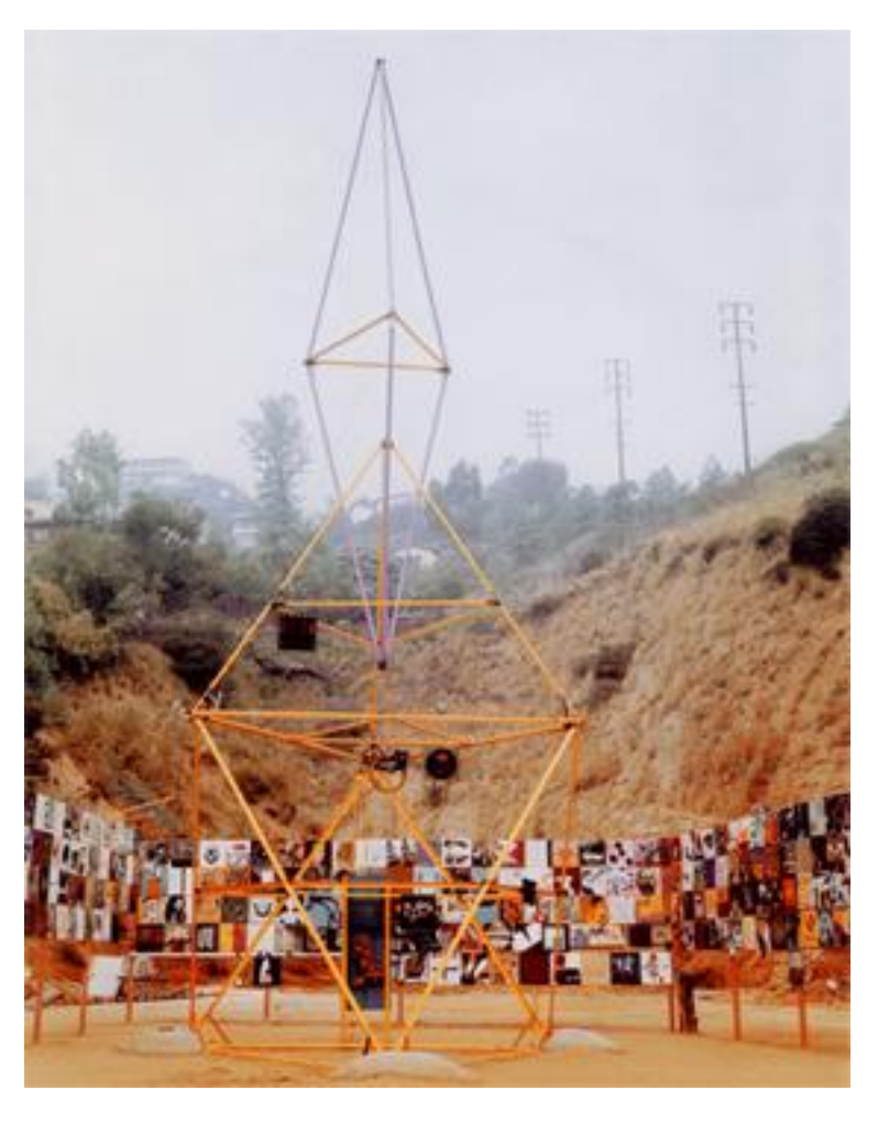
Fig. 25 Mark di Suvero and al., PeaceTower , Los Angeles, 1966, also known as the Artists' Tower against the War in Vietnam