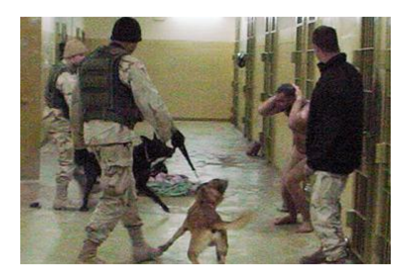
Fig. 10 Torture in Abu Ghraib camp, Baghdad, 2003