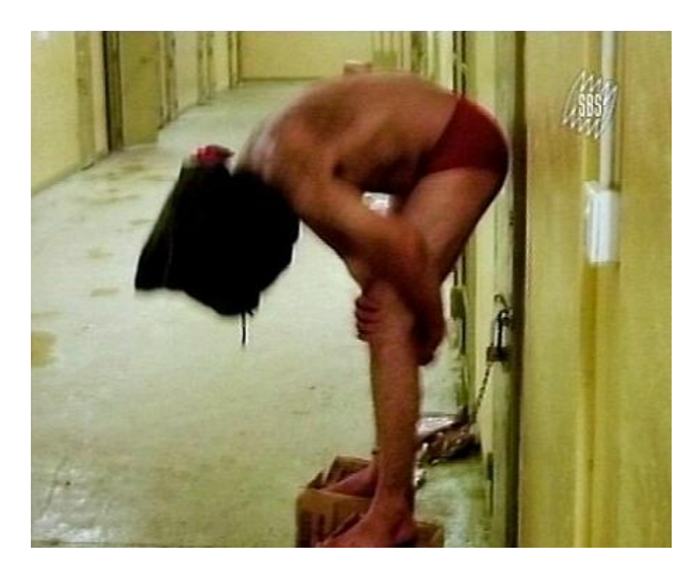
Fig. 13 Torture in Abu Ghraib camp, Baghdad, 2003