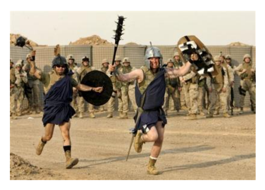
Fig. 16 US Marines of the 1st Division dressed as gladiators