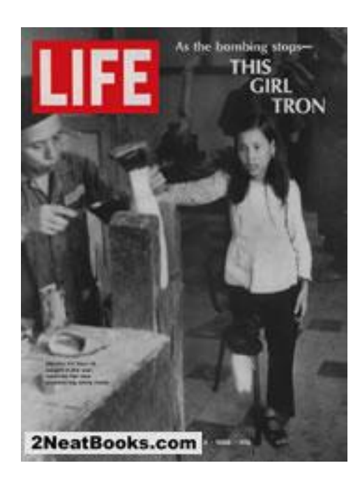
Fig. 22, Life, cover page, 8<sup>th</sup> November 1968