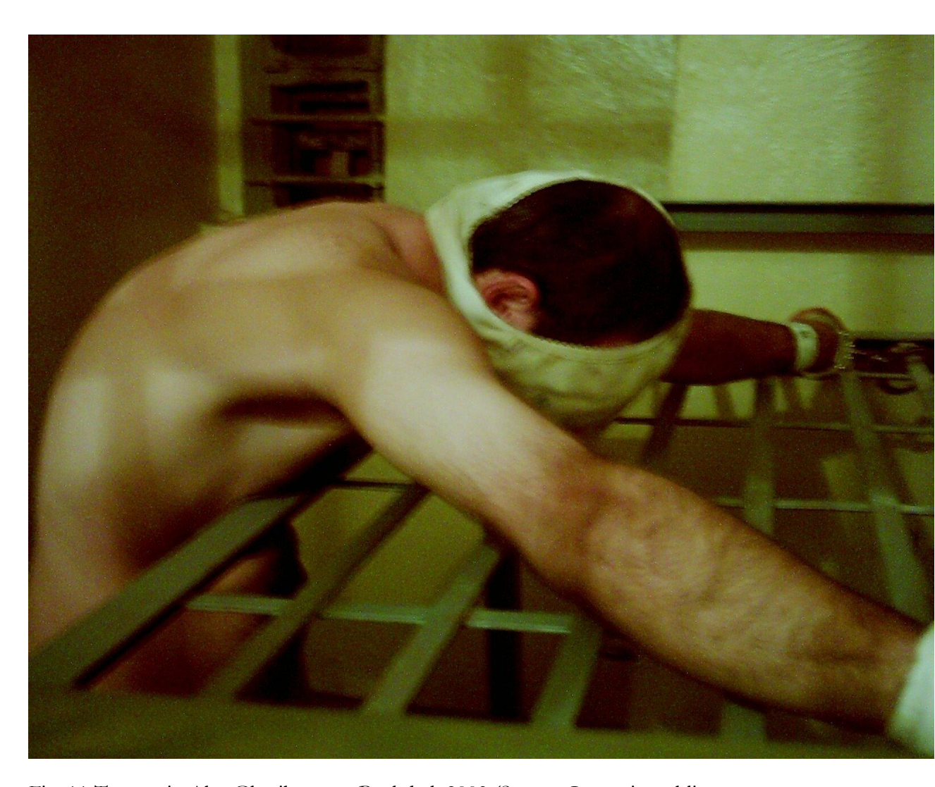
Fig. 11 Torture in Abu Ghraib camp, Baghdad, 2003