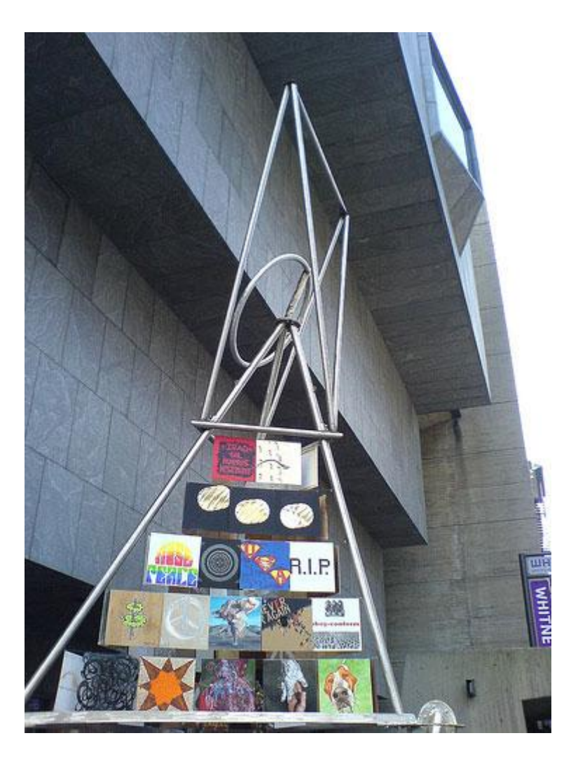
Fig. 26, Mark di Suvero and Rirkrit Tiravanija (and invited artists), Peace Tower , installation at Whitney Museum, New York, 2006