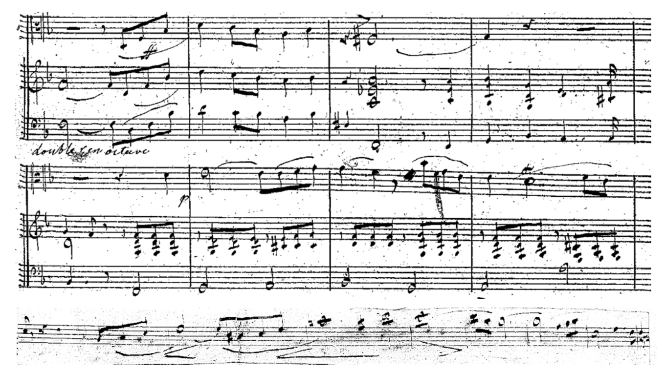
Illus. 3: First manuscript, mm. 33-40 and its new version in the second manuscript (third line).