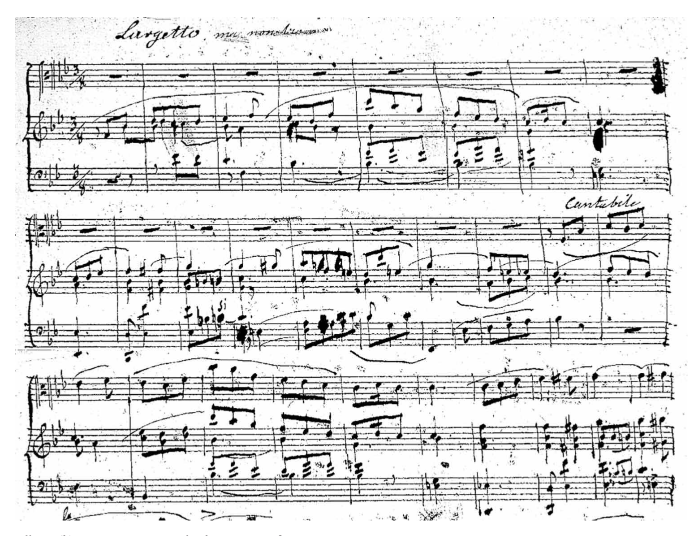
Illus. 9(b): opening measures, third manuscript/first manuscript.

This arrangement has proved to be reasonably effective, as it gives a better development to the melodic line in the viola part and therefore avoids unnecessary repetitiveness. (See Illustration 10.)