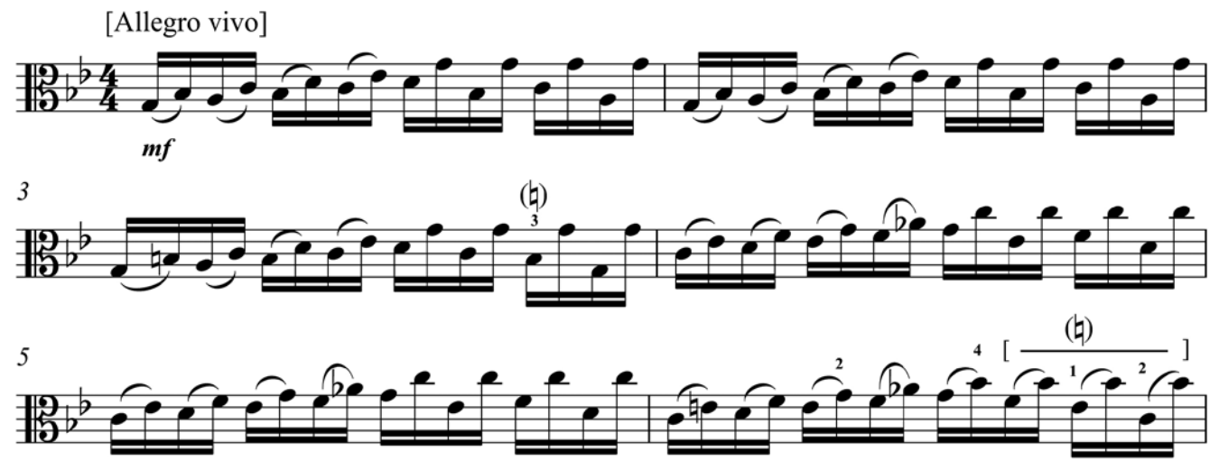
Illus. 1. Bach arr. Borisovsky, Pedal Study for organ.

Borisovsky's interest in the organ, which he taught himself to play in Italy from 1912 to 1914, was reflected many years later in his viola arrangements of Bach. One of them is Borisovsky's transcription for viola solo of the little-known Pedal Study for organ.<sup>3</sup> Borisovsky explored many varieties of bowing and fingering, often using combinations of legato and detaché in high positions with uneasy stretches, in order to fully demonstrate the broad range of sound and timbral qualities of the organ. These difficulties do not become technical obscurities but add elegance and clarity to the musical articulation. The viola is not in competition with the organ; rather, it illustrates the diversity of technical possibilities with string crossings, leaps from the low to the high register, and the expressive capabilities of the instrument. Borisovsky