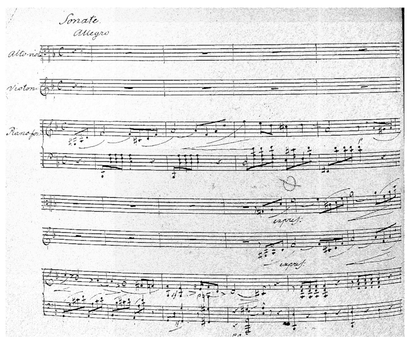
Illus. 4(b). The opening from the third manuscript.

likely that the last pages were simply lost as possibly were the last pages of the first manuscript.