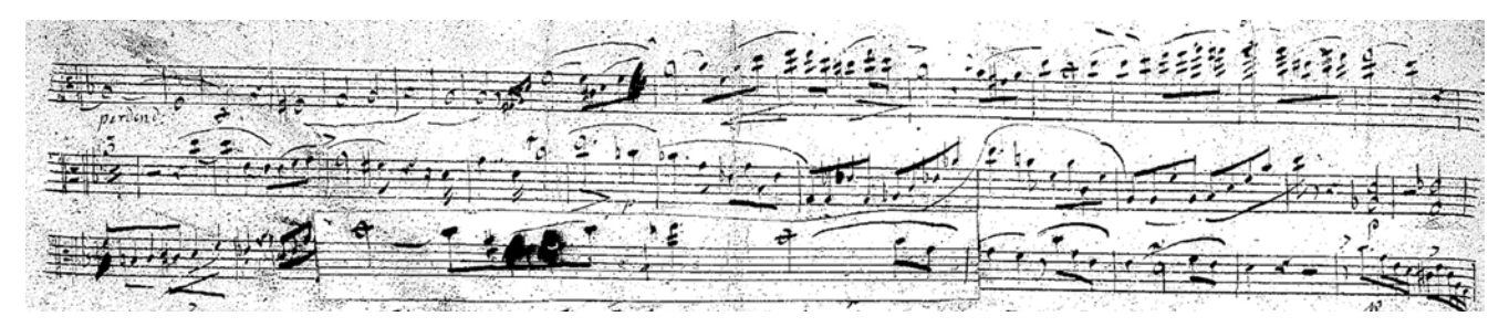
Illus. 8: Recapitulation, second manuscript, page 2, lines 1-3.