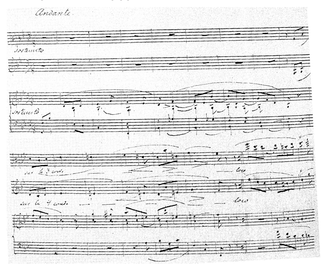
Illus. 9(a): opening measures, third manuscript/first manuscript.

The recapitulation also had only minor alterations in the second and third manuscripts. (See Illustration 8.)