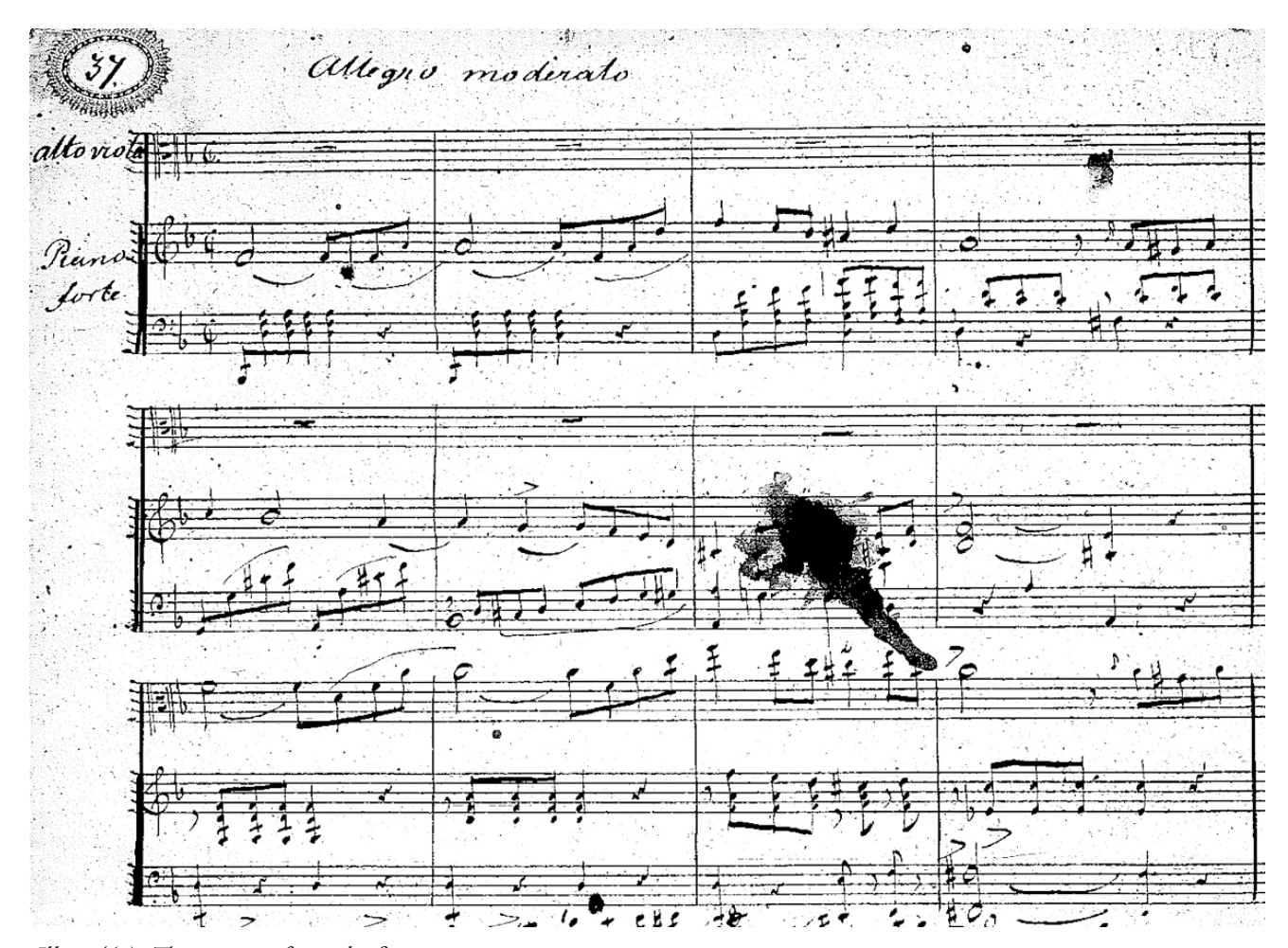
Illus. 4(a). The opening from the first manuscript.