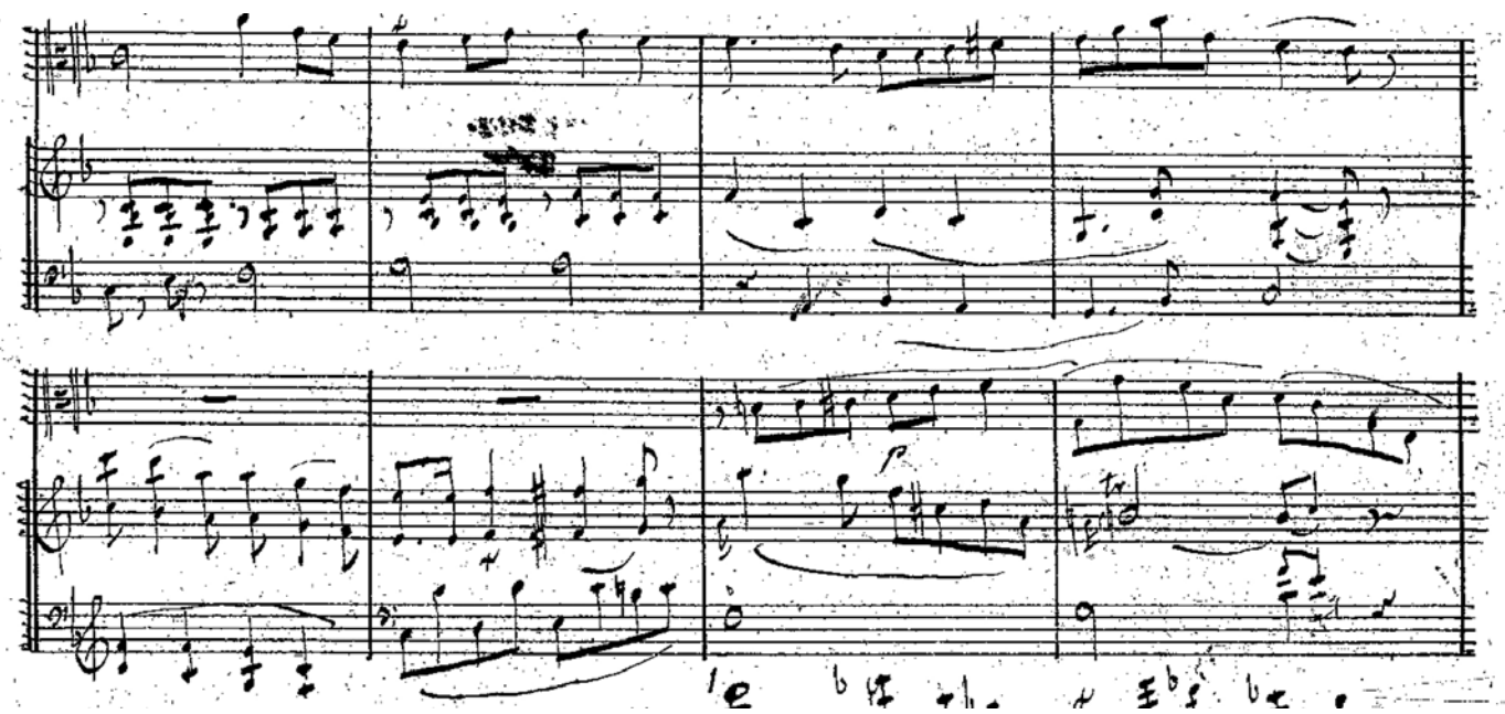
Illus. 6. Second subject, first manuscript, pages 3-4.