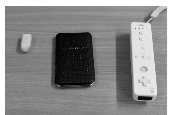
Figure 1. WAX, iPhone and Wii-remote

The study took place on two UK universities, one day at each location. The participants were graduate students and university staff as well as members of the general public in the community surrounding the university. The three objects were placed on a table in a neutral room and high quality stereo loudspeakers centered along one wall, giving uniform sound distribution. The study subject stood in front of the table, and an interviewer in the corner by the laptop.