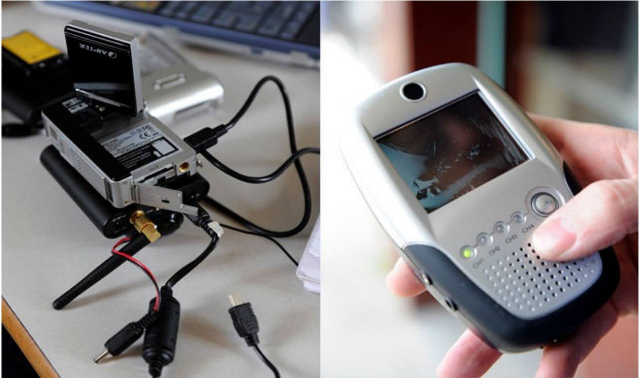
Fig. 1 Recording and sniffing devices (Deptford.TV).

Deptford.TV is an open and collaborative platform for media artists and network activists, conceived by dr. Adnan Hadzi (Dept. of Media, Goldsmiths). Since 2005 Deptford.TV has been experimenting with art and media methods in order to increase participation and sharing of research practices. With the Centre for Urban and Community Research, it launched a series of practice-based workshops on collaborative filming and CCTV 'sniffing' with the aim 'to store, share and re-edit the documentation of the urban change of South East London'. 4 Participants, equipped with digital video receivers, cached surveillance camera signals from public and private spaces which were previously invisible (Fig. 1). Following the uncertain signals and the glitches from the electronic waves captured by the device, they were led through inner city Deptford. Some of the questions that workshop participants asked were: What