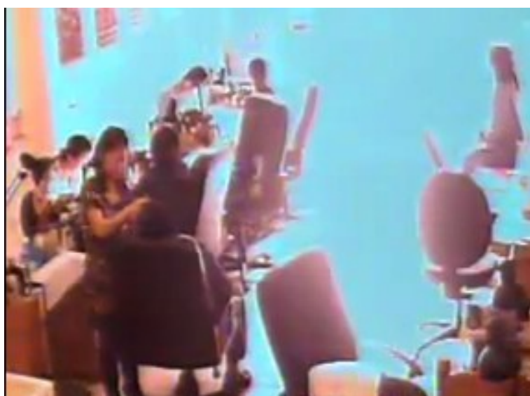
Fig. 6 Nail shop and parlour, Deptford.