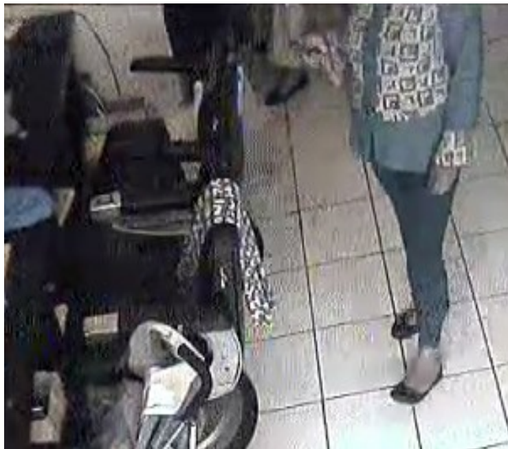
Fig. 5 Hairdresser's, Deptford.

normative novel of gentrification as a cultural process 'lifting everybody up' (Allen, cited).