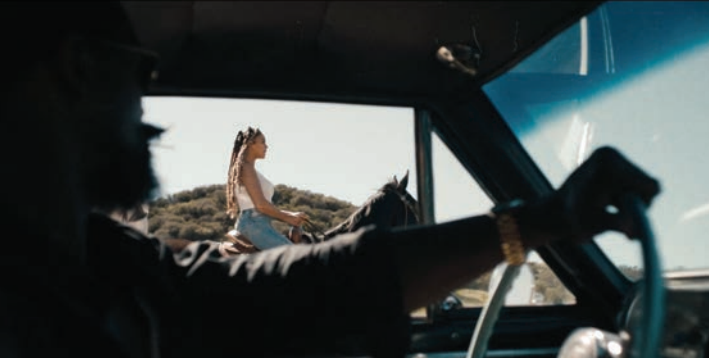
Figure 9 Visual speeds highlight the song's varied rhythms: at mid-tempo, figures move in imaginative ways.