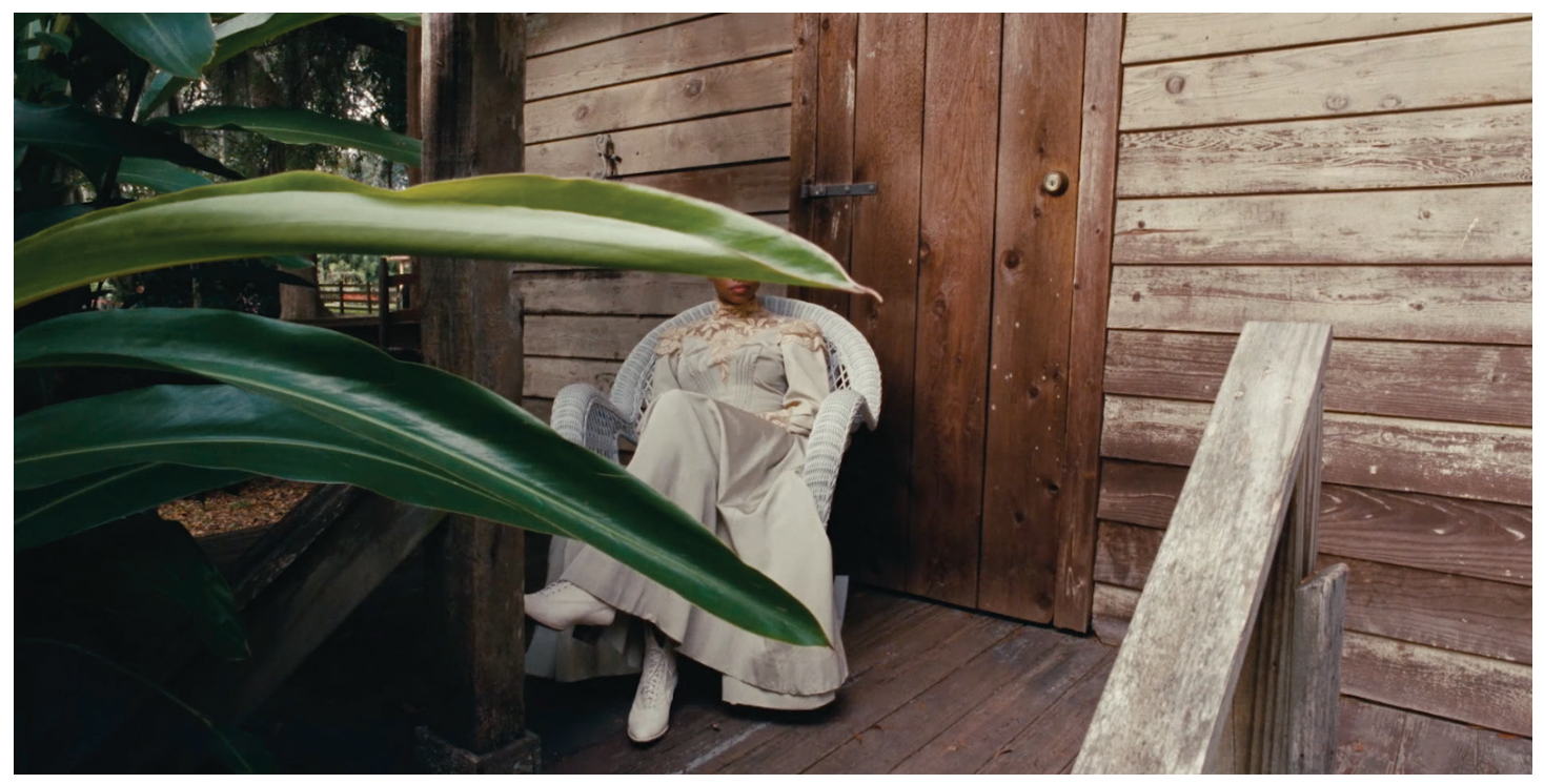
Figure 10 Audiovisual bridges are comprised of visual tableaux, moving, relatively static or still.

Carol: And there are many other details one might draw attention to, like the ways songs in the film's second half mirror the first. "Hold On" and "All Night" connect via Jamaican ska (both have reverby guitar on the off-beats and heavy bass on the strong beats). "Sorrow" and "Love Drought" foreground glistening synths (reminiscent of DX7s of the 80s) and light, busy percussion pads in the high register. Lemonade's songs and sonic materials sometimes transition smoothly into one another. James Blake's "Forward" fluidly emerges out of "Sandcastles." "Sorrow"s bell-like synth slowly thickens to become what Holly has described as a gamelan figure. The rhythmic pattern that momentarily comes to the fore as Beyoncé sings "better call Becky with the good hair" threads through the album. Might Lemonade's atypical forms and unpredictable song-lengths showcase Beyoncé's fluid phrasing and unusual rhythmic delivery?