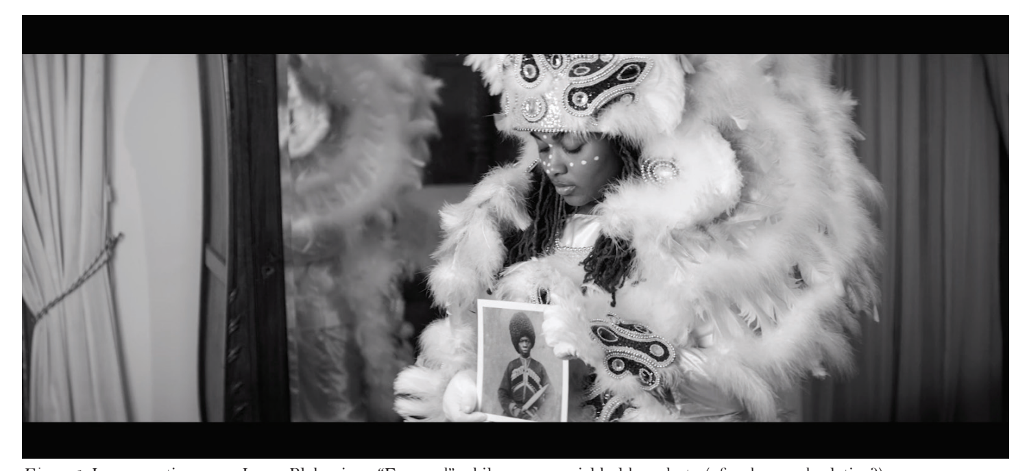
Figure 1 Incorporating men: James Blake sings "Forward" while a young girl holds a photo (of a deceased relative?).

The ways Lemonade politically incorporates African American men is first subtle, and it's addressed to the ear. The many instances of the film's plaintive, empathetic singing performed by men, often in the role of chorus and/or call and response (The Weeknd, James Blake, Kendrick Lamar, Jack White, and early field recordings of male, African American prisoners) is one example.