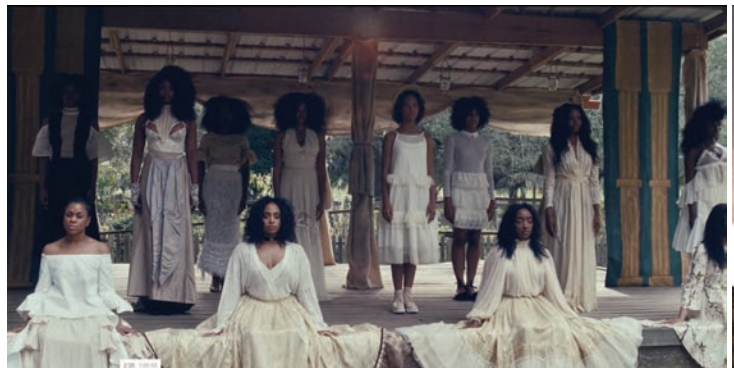
Figure 2 An interstitial section: Beyoncé wonders, "Where do you Figure 3 Shifts between moments of audiovisual sync and nongo when you go quiet?"

Holly: A second aural example: during passages between songs, Beyoncé's voice is so close-miked we might feel we're eavesdropping on her thoughts. This interiorized self references listening and silence ("pray I catch you whispering, I pray you catch me listening"). A moment later, as the "Pray You Can't Catch Me" song splits in two to make a space for a more avant garde-influenced, poetic, interstitial section, she asks "Where do you go when you go quiet?" Later, a drummer sits at her instrument, silent and motionless; later still, Beyoncé laments "we can't hear them [the orchestra]." These evocations of seeking to utter and straining to hear suggests a facility at both guiding and responding to an offscreen auditor. Beyonce's intense attentiveness, a musicianly approach, might also be read as a mark of oppression—people with power don't need to pay close attention (see figure 2).