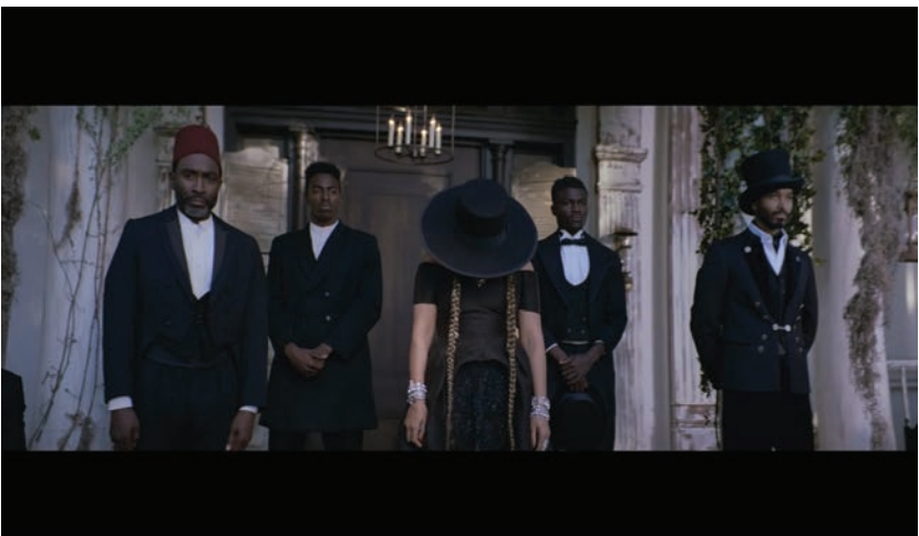
Figure 12 Did Beyoncé burn down the massa's house (as in Quentin Tarantino's Django Unchained)? Figure 13 In "Formation," a shadow memory of a lynching?

sidering are Lemonade's ghostly figures: Beyoncé's first white-fleshed and white-haired guises, and the painted-white female dancers in the night-lockers, necks snapped back and then forward, as if they had been cut loose from the hangman's rope. Later, when an immobile Beyoncé intones "Freedom" from a stage, the dangling lights behind her resemble nooses. In "Formation," her bobbing head and grasping hands alongside a "doing-doing" sample might suggest a shadow memory of a hanging. Other details, too, take us back to the era of slavery and later structures of oppression: Beyoncé's and young girls' antebellum kerchiefs and dangling iron chains; a woman with a scar; old photographs scattered among grass and metal. Beyoncé's threat of "your worst nightmare" may be this. As she sings in "Formation," under these circumstances, "Always stay gracious, best revenge is your paper." (see figure 13).