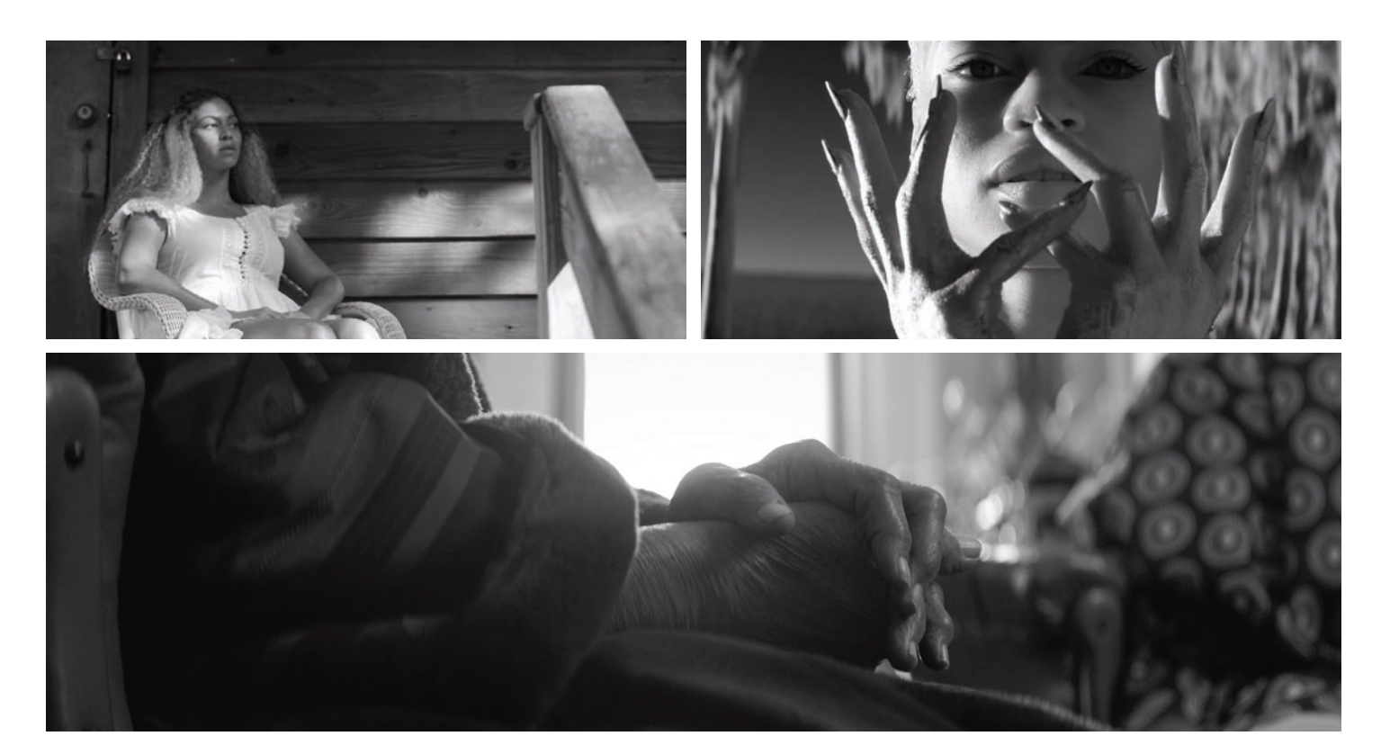
Figure 16 Images of forgiveness

re-choosing a relationship is the right choice: "I'll trade your broken wings for mine; I've seen your scars and kissed your crime." "We're going to heal." "L-O-V-E the Lord." We assume that the principles that have enabled a people's survival have become a sacred mode of life. ("Grandmother, the alchemist. You spun gold out of this hard life. Found healing where it did not live. You passed these instructions down to your daughter. Who then passed it down to her daughter.") (see figure 16).