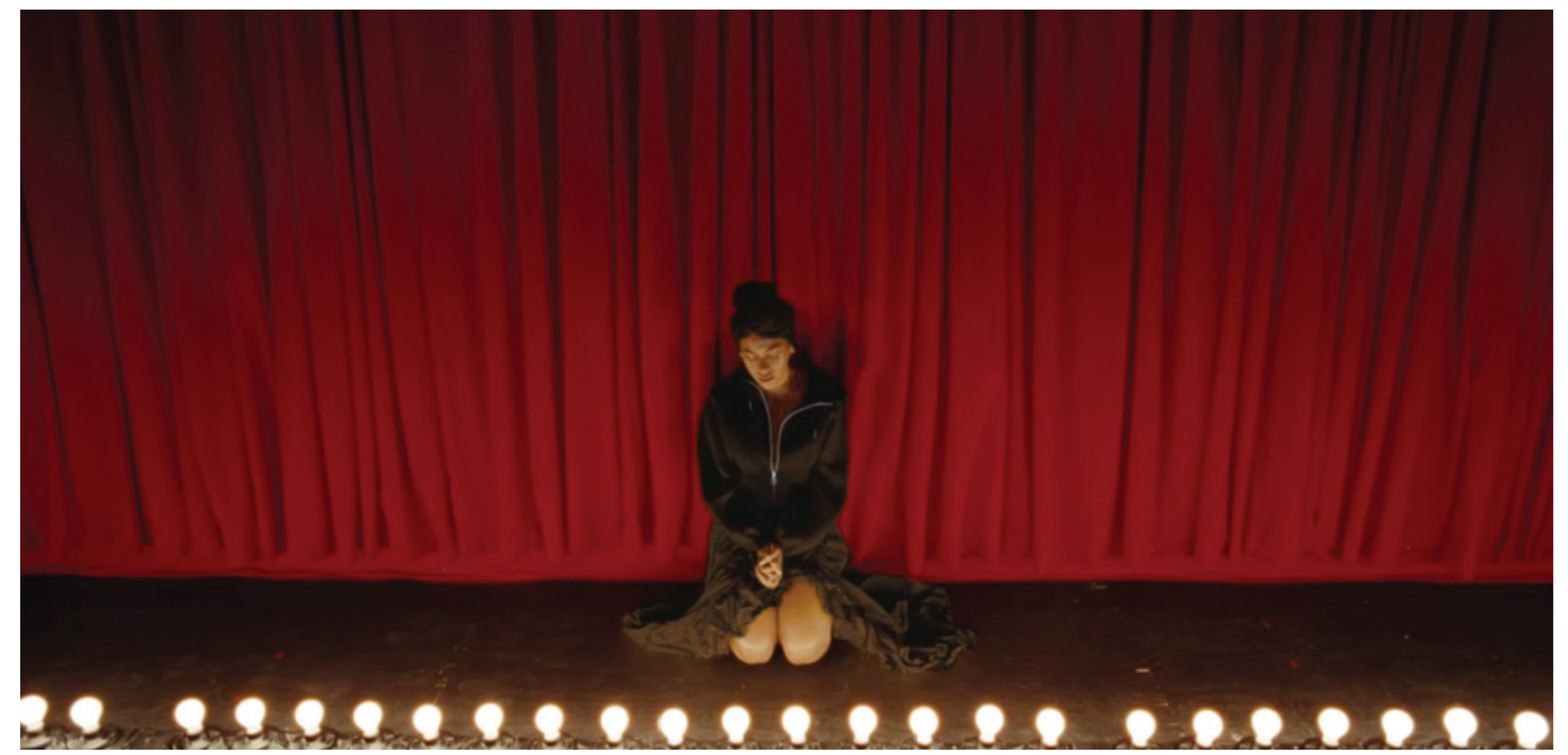
Figure 4 Beyoncé's overdubbed voice is dislocated from her body.

Holly: Near Lemonade's beginning, Beyoncé appears kneeling before a red-curtained stage, singing as if in prayer. Her voice, layered on itself, is strong and unified, but dislocated from her body. Later, in a section devoted to images of community, we see archival footage of a New Orleans jazz band playing in the street. While their performance seems plausible, we hear non-diegetic music (the trumpeter fingers a different tune; the camera shifts perspective while the mic's point of audition remains constant; no one is clapping). In moments like these, we're thrown. How might we align ourselves with these instances? (see figure 4). But following these are often moments when we're swept back in—Beyoncé enunciating the word "Texas;" the girl wearing the Mardi Gras' costume shaking her tambourine, and James Blake intoning "oh death;" Beyoncé exclaiming "magic" before an infant appears; or declaiming "freedom!" from the stage. Surely many viewers might wish to bond with others during these communal, political moments. I agree that Lemonade's hybrid form moves us affectively and encourages critical reflection. bell hooks might claim that a viewer would not perceive these moments on first viewings, but music videos are intended to be watched many, many times.