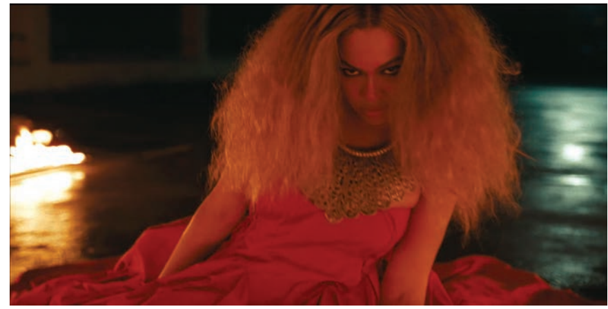
Figure 14 Music video's visual threads: images of menses become redemptive.

Sometimes a motivic strand has a strong affect that shifts between positive and negative valences. In one of the interstitial passage Beyoncé says "plugged up my menses with pages of the holy book," and in another "Tills the blood in and out of uterus." Wakes up smelling of zinc." (see figure 14). It's frightening and profane. Later, the camera tracks down a terrifyingly red, Kubrickian hallway. But