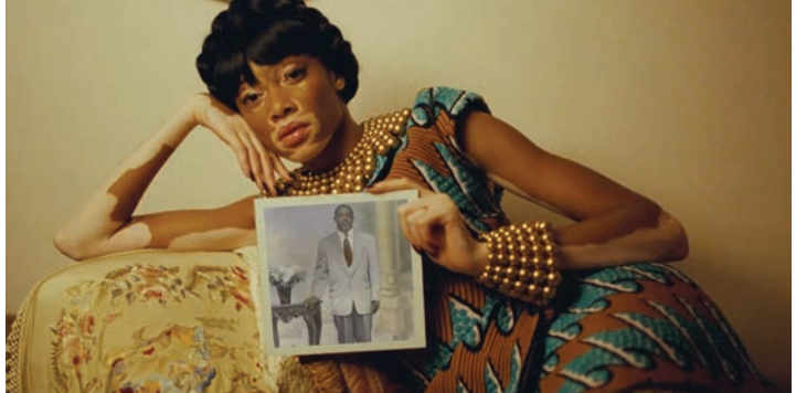
Figure 15 Images of whiteness become more generous, depictions of whiteness more generous.