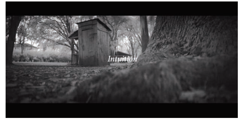
Figure 11 Details take us back to the era of slavery.

Carol: We can now talk about the ways that Lemonade shimmers between depictions of infidelity and a history of racial oppression—the murdering of African Americans, from the Middle Passage and lynching, to the floods of