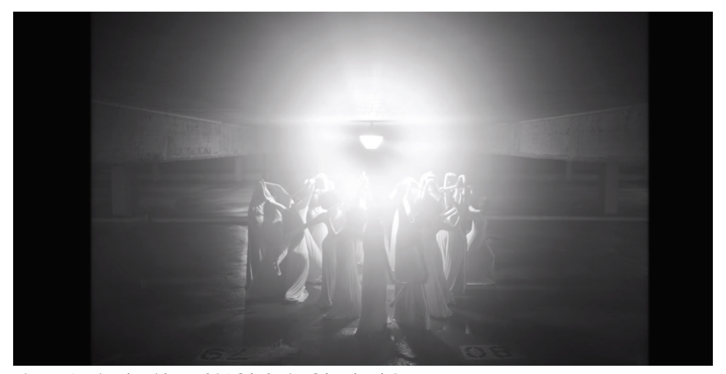
Figure 17 A sonic and spatial struggle? A fight for air, a fight to breathe?