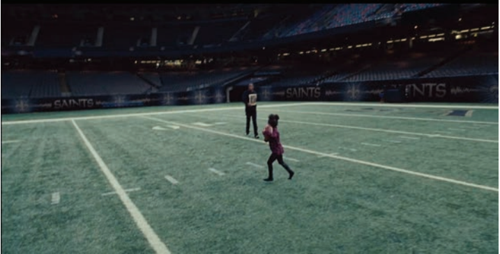
Figure 8 Establishing beginnings, middles and ends: long tracking shots and figures in motion appear frequently.

calls forth "I am the dragon breathing fire." Out of a dark vaginal hallway, Beyoncé steps up in search of pesos. Later, a young girl plays a tambourine and calls up the spirits around a table with empty place-settings. Then Beyoncé and her crew suddenly call "magic": we see an infant on the bed and we hear celebratory Hammond organ. Beyoncé climbs up from the underground through a slit.