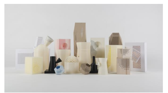
Figure 1: Multiple iterations of the enclosure of the Energy Babble.

Developing the material characteristics on the device required explorations along various lines, from functional and pragmatic requirements to the technical demands of the hardware contained enclosed within the form. Overall however, was the deep investigation of the aesthetic qualities of the object that had to embody all of these concerns as well as the key research agenda and questions.