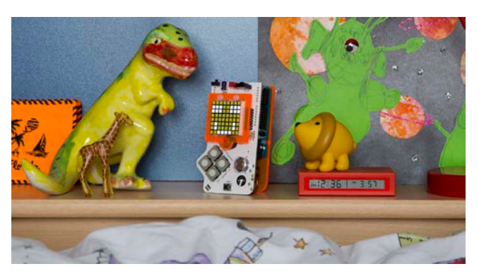
Figure 1: The DIY Gamer Kit

Through this process, we realised that designing kits is different to designing products since the device must be completed by the end user. We found that this home assembly not only enables the user to gain valuable skills, but it also creates a personal bond between the maker and their creation. This creates a desire to spend time with the device and learn new skills in the process of doing so. Furthermore, the designer must create multiple entry levels, as well as multiple activities in order to widen the variety of engagement and include as many users as possible.