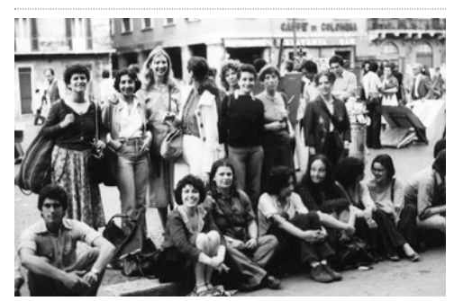
Feminist Duration: A Reading Group on Feminisms, Consciousness-Raising and Leave-Taking