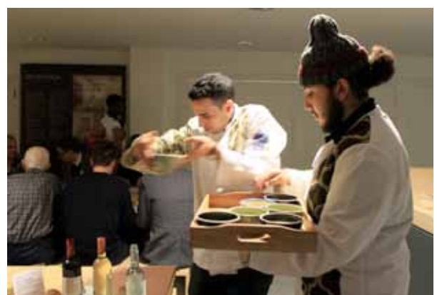
muf architecture / art