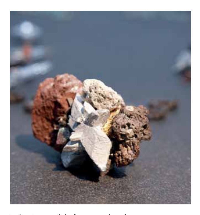
Indicative model of proposed work

Cohen and Van Balen will create an art work as an artificial ore made from the different materials 'mined' from the products and parts used in the building of Ruskin Square.