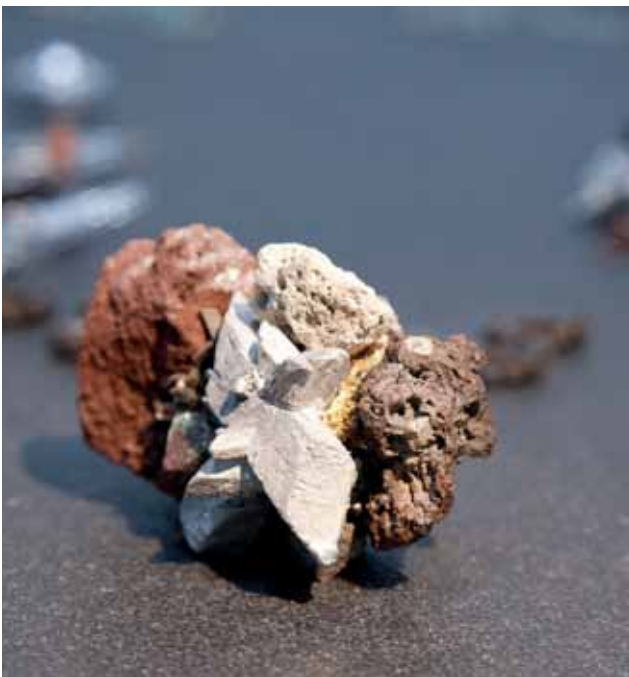
Indicative model of proposed work

Cohen and Van Balen will create an art work as an artificial ore made from the different materials 'mined' from the products and parts used in the building of Ruskin Square.