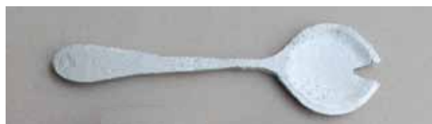
Ruskin Square Art Strategy

The cutlery, crockery and food for the dinner was produced working with local social enterprises and with a team of local young care leavers over a period of 3 months. The team constructed bellows and a furnace to smelt aluminium waste from the building site to make cutlery, which was polished on the pedal powered grinders and clay was extracted from soil dug from the site to make drinking vessels and an oven, in which to cook bread.