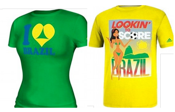
Figure 5: Adidas t-shirts promoting sexualised images of Brazilian women during the 2014 World Cup in Brazil

international pornography industry (Beserra, 2007), the international sex tourism industry (Piscitelli, 2008) and other markets of cultural and sexual exoticism, as we can see in Figure 5.<sup>35</sup>