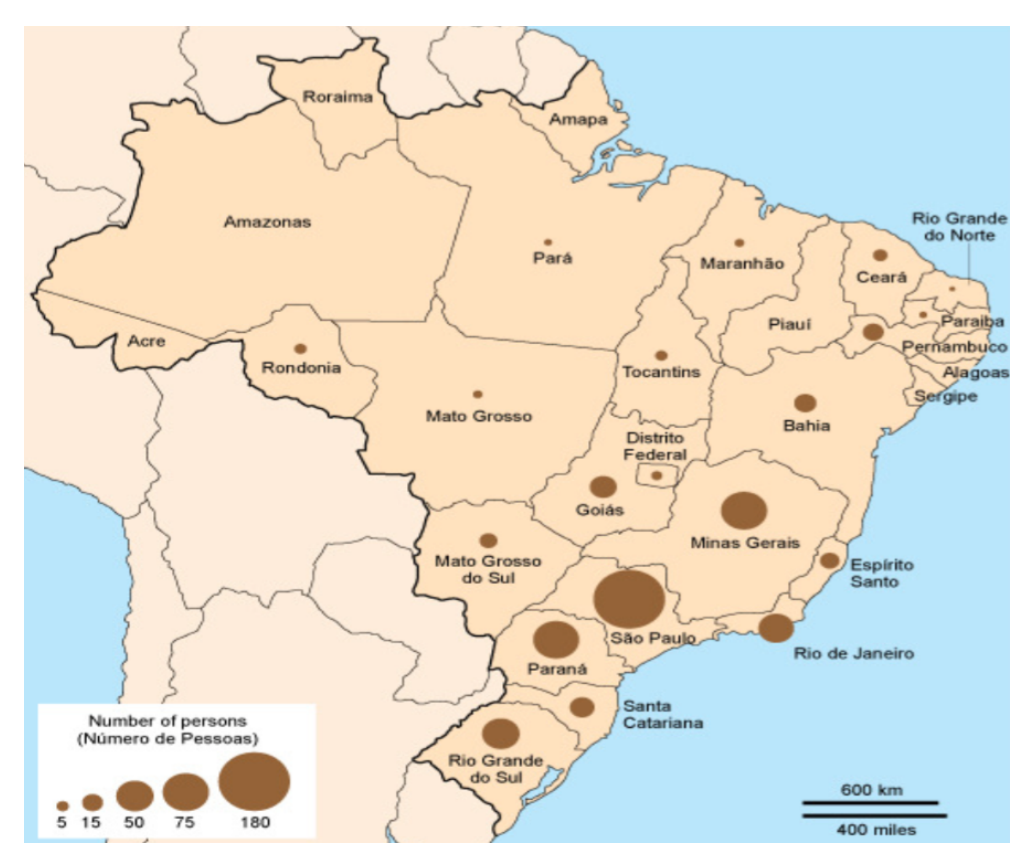
Figure 2: Map with migrants' origin in Brazil